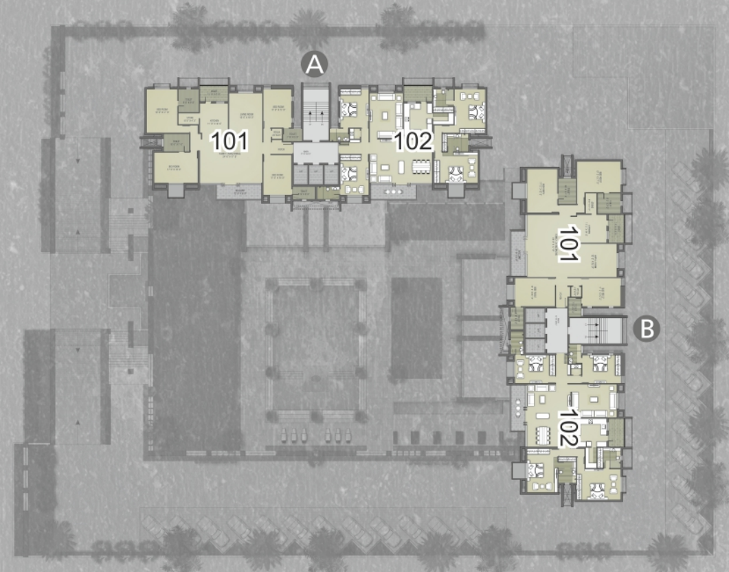
4 BHK typical unit plan