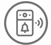
Video Door Bell