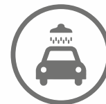
Car & Bike Wash Area