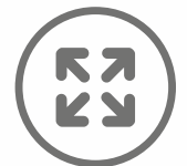
Wide Attractive Entry