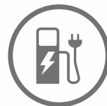
Electric Car Charging Point