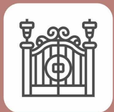
Entrance Gate with Security Cabin