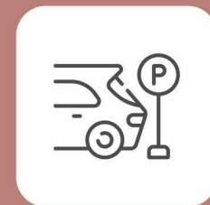
Sufficient Car Parking