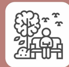
Senior Citizen Sitting