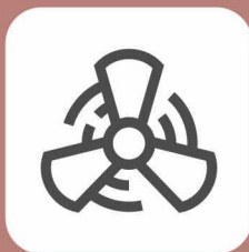
3 Side Open Air Vantiled