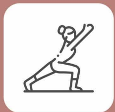
Yoga Space/ Aerobics Space