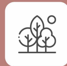
Beautiful Garden & landscape