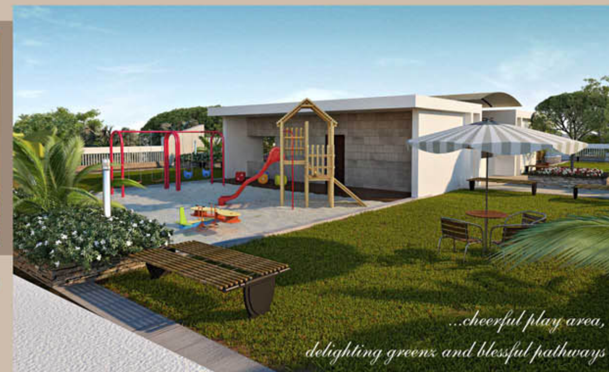
...cheerful play area, delighting greenz and blissful pathways