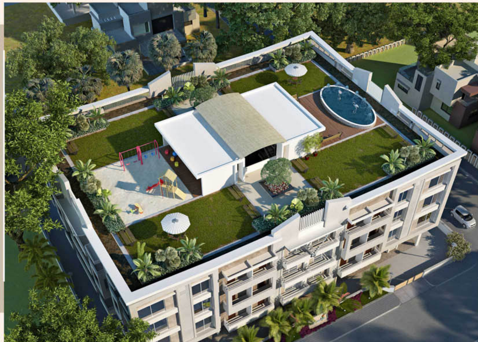
Kids Play Area | Sitouts | Walk-ways | Garden | Water Body

...plush lifestyle altitude rendered on terrace