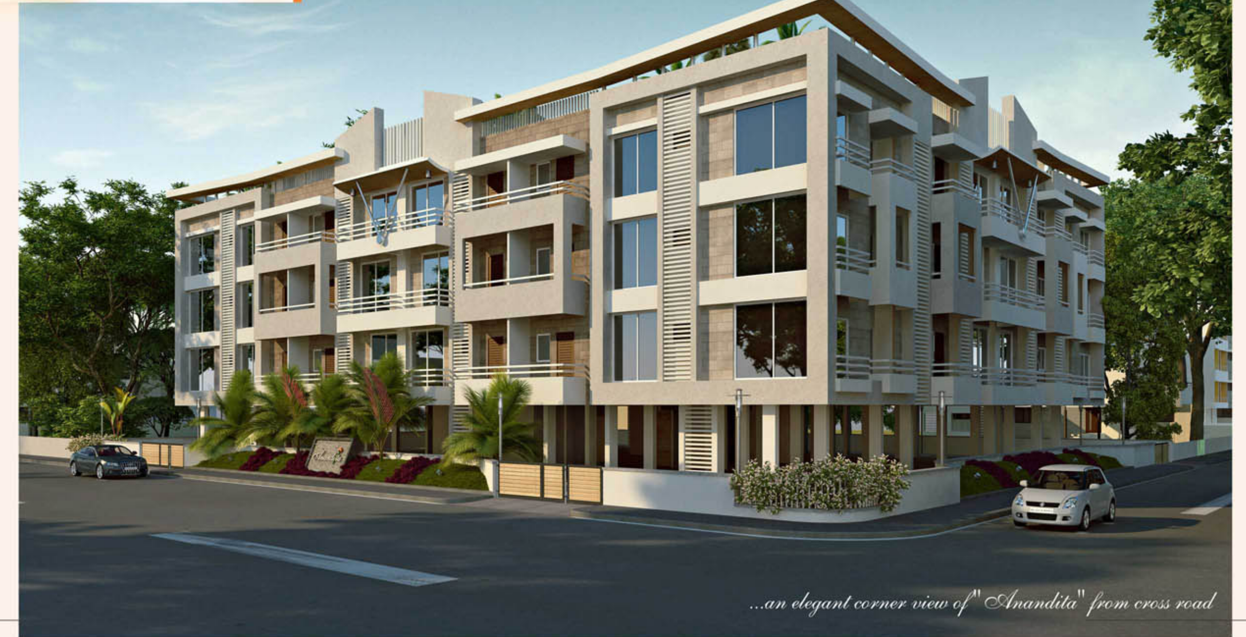
...an elegant corner view of "Anandita" from cross road