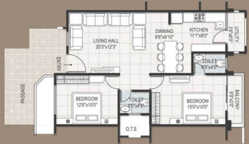
Typical Unit Plan For 2BHK - Option 2