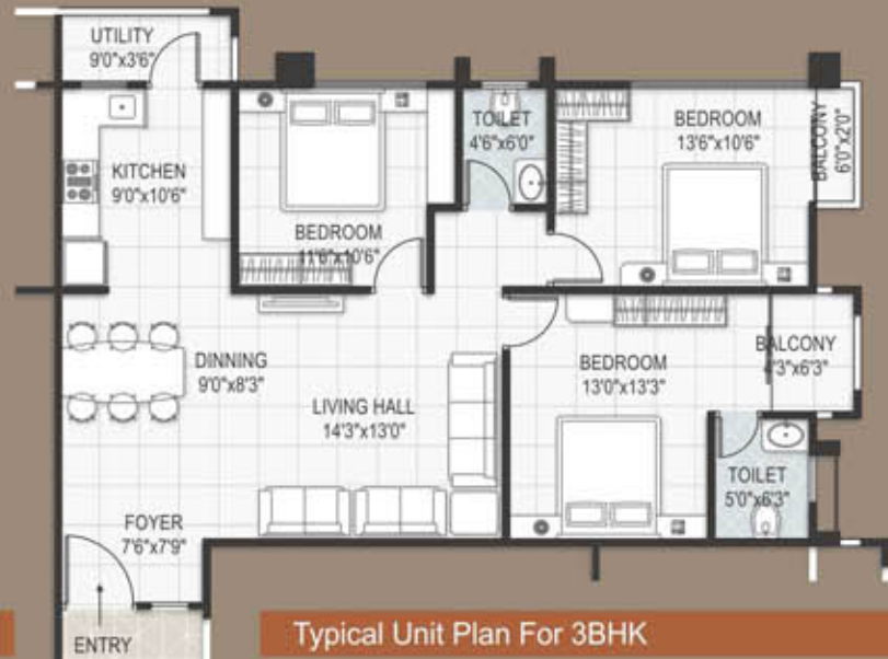
Typical Unit Plan For 3BHK

A-Wing B-Wing Flat No. A-102, A-105 & B-102, B-105 Flat No. A-202, A-205 & B-202, B-205 Flat No. A-302, A-305 & B-302, B-305