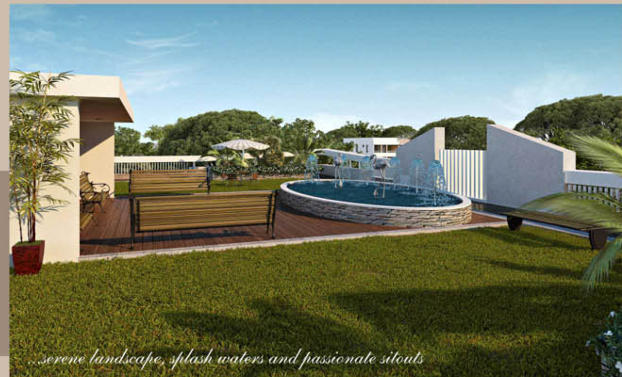
...serene landscape, splash waters and passionate sitouts

at "Anandita", we have elevated the garden into mid air. Located right on the terrace in stylized way, with shrubs and creepers, or with a little bonsai. This well designed space is suited for members to get together . With an luxurious overview of the surrounding greenery, it is the ideal space to enjoy rejuvenated mornings and quiet evenings .