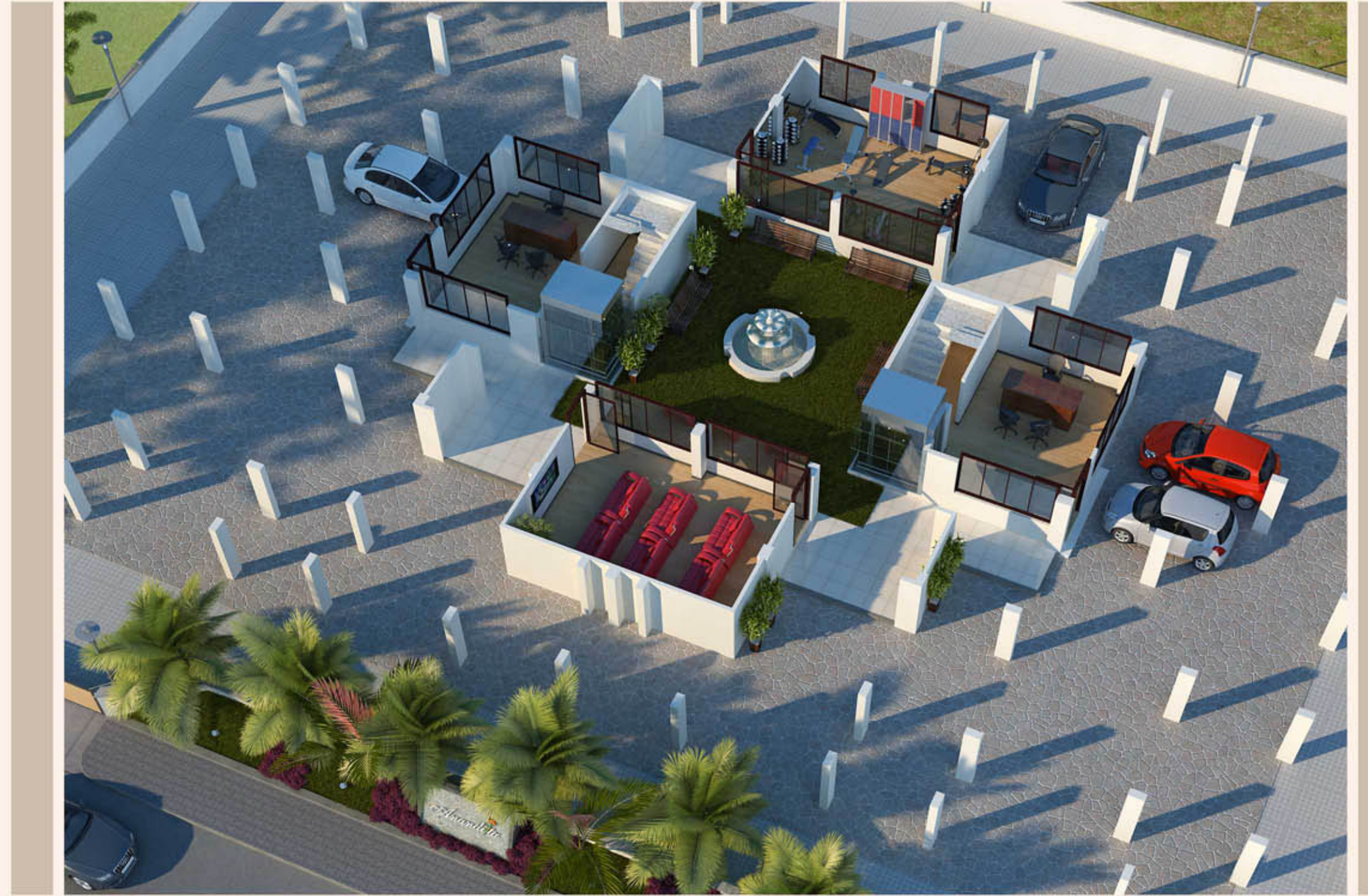
...recreation cells at ground floor