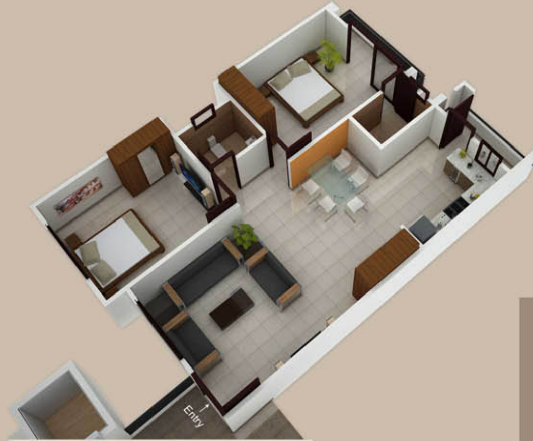
Isometric View for 2BHK - Option 1