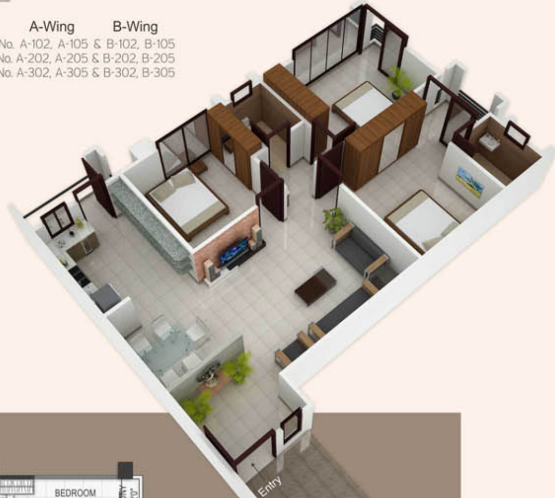
Isometric View for 3BHK

A-Wing B-Wing Flat No. A-102, A-105 & B-102, B-105 Flat No. A-202, A-205 & B-202, B-205 Flat No. A-302, A-305 & B-302, B-305