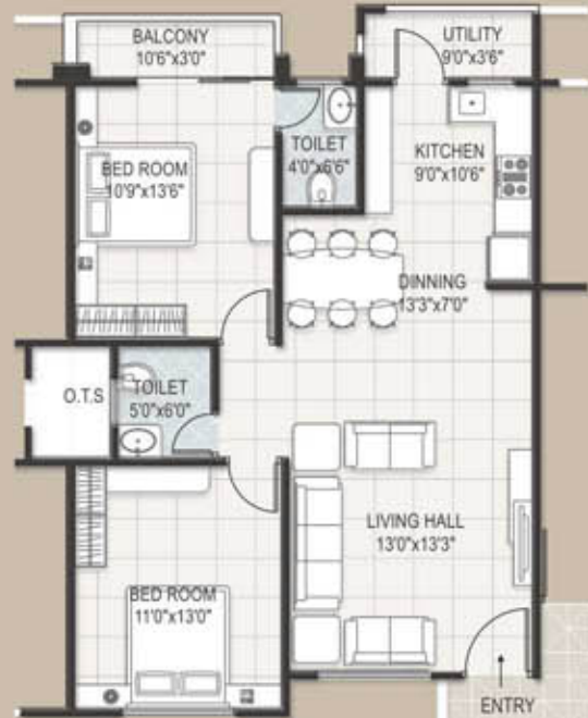
Typical Unit Plan For 2BHK - Option 1