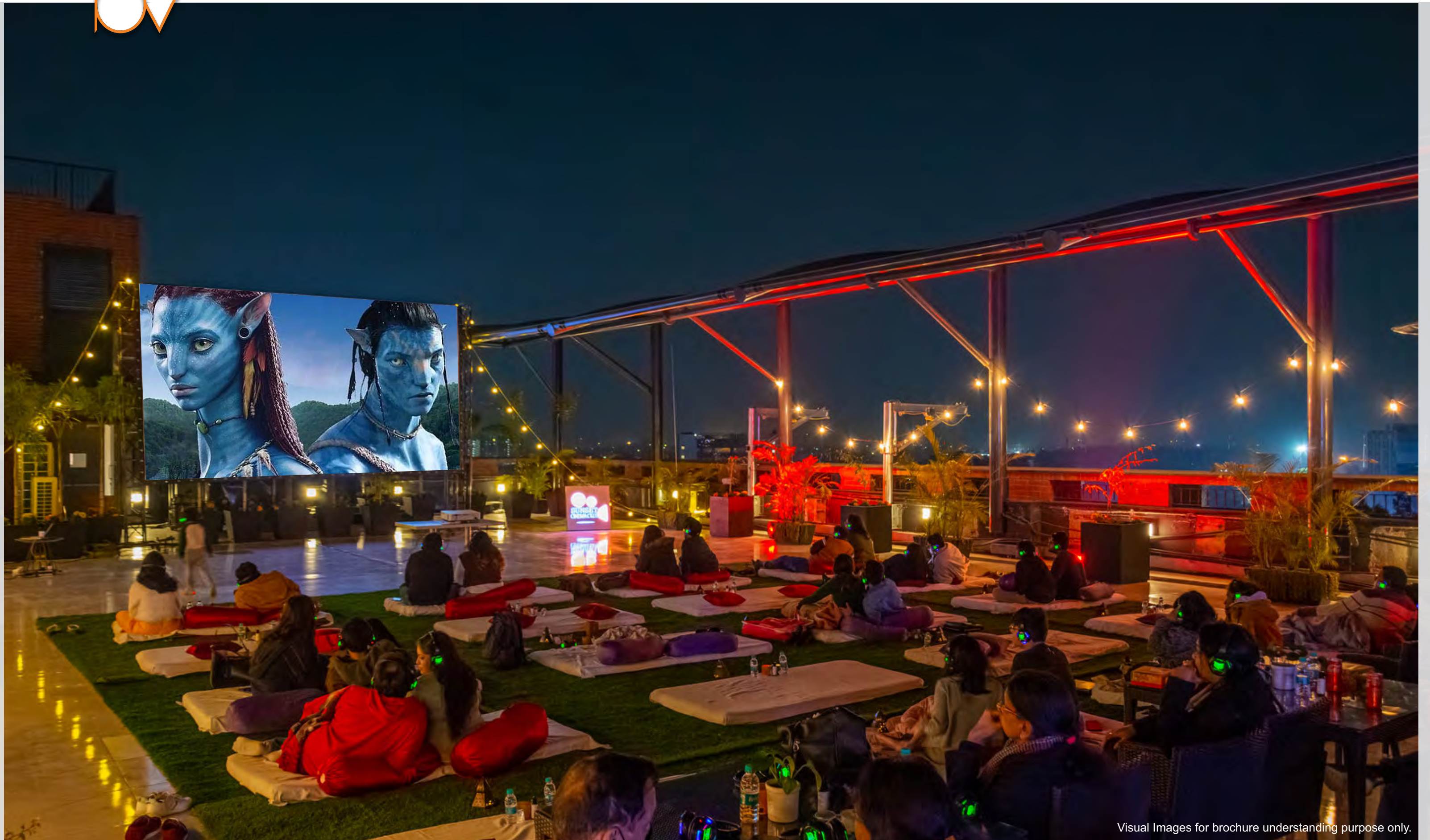
Visual Images for brochure understanding purpose only.