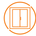
Card Access Elevator