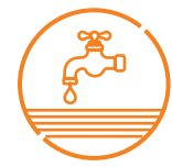
24x7 Water Supply