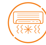
4 - Split A.C.