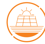
Solar panel For Common Use