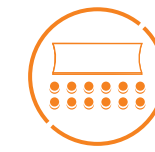
Open Air Theater