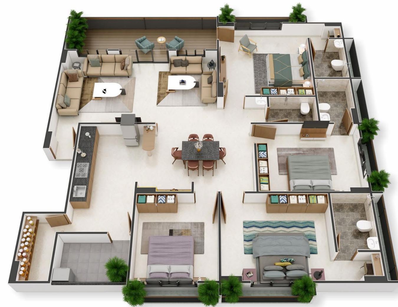
3D SECTION PLAN