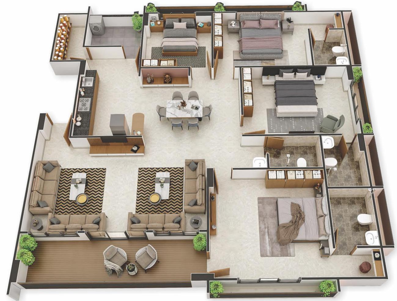
3D SECTION PLAN