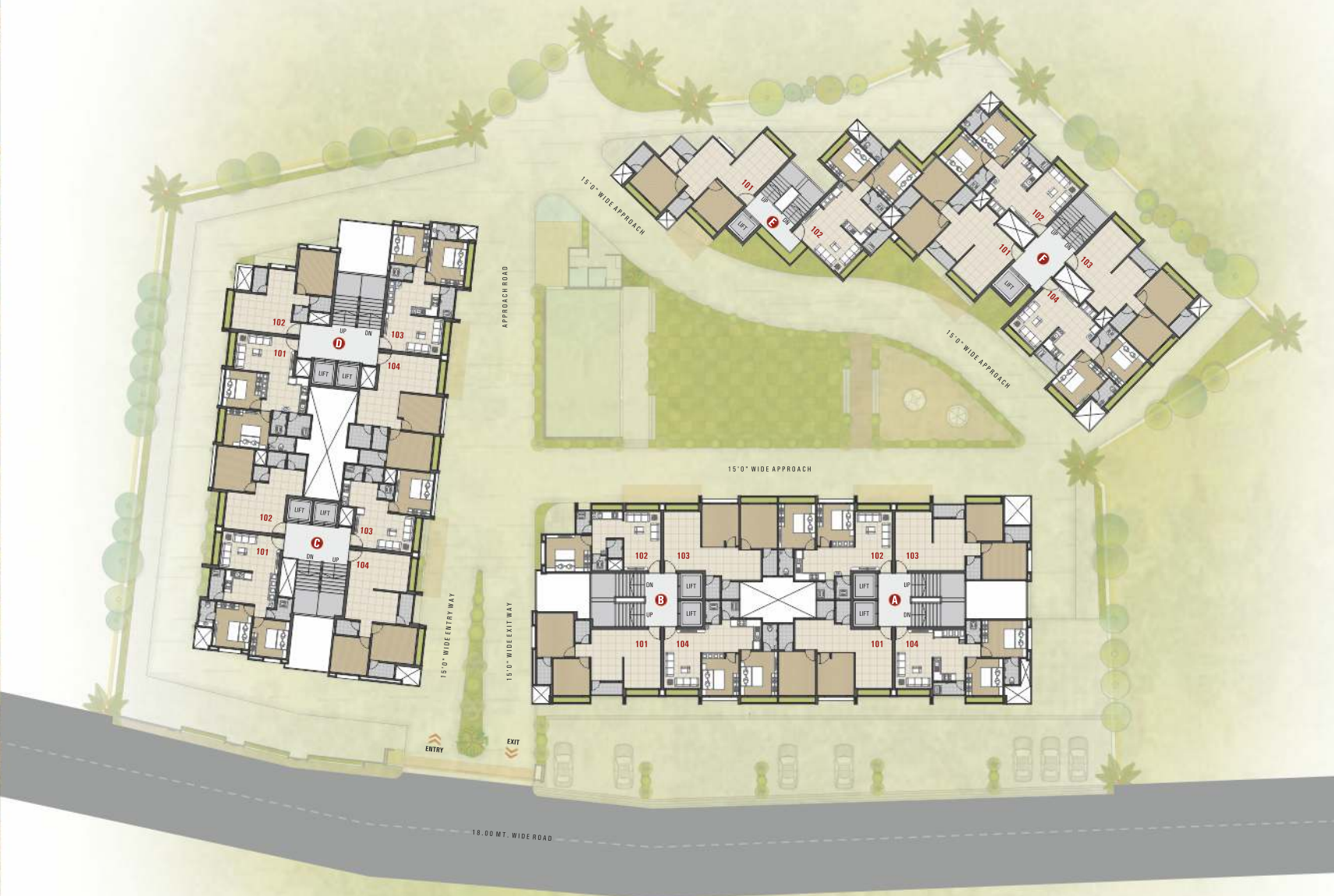
ALL DIMENSIONS / AREA UNFINISHED APPROXIMATE, AVERAGE & SUBJECT TO VARIATIONS