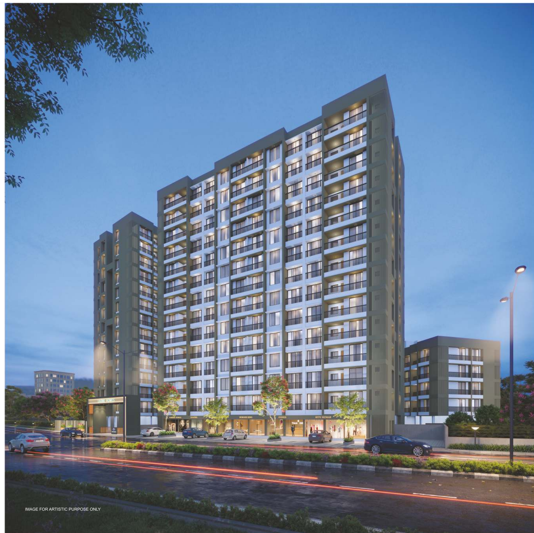
IMAGE FOR ARTISTIC PURPOSE ONLY