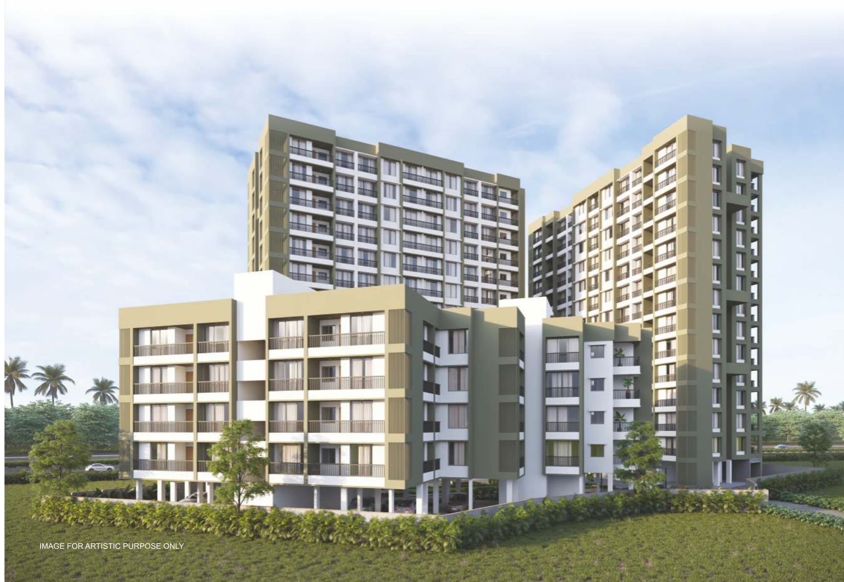
IMAGE FOR ARTISTIC PURPOSE ONLY