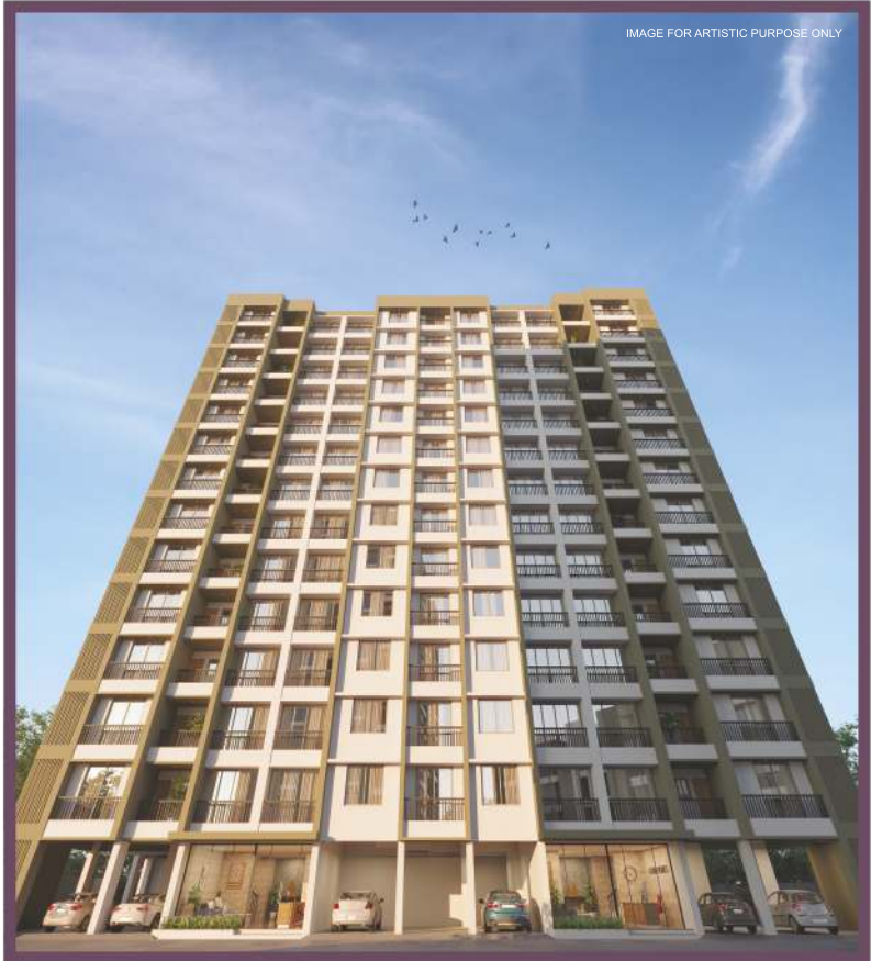
IMAGE FOR ARTISTIC PURPOSE ONLY