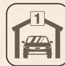
FIRST FLOOR PARKING