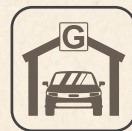
GROUND FLOOR PARKING