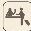
A.C. RECEPTION AREA