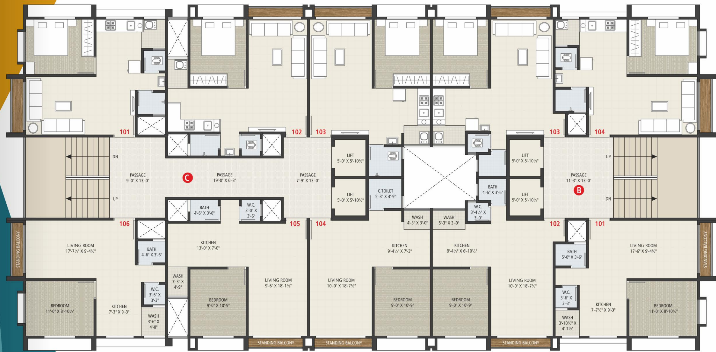
TYPE B & C