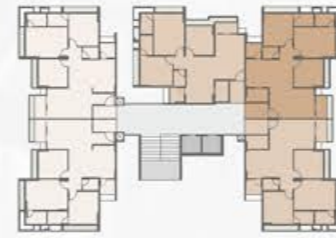
TYPE - 1