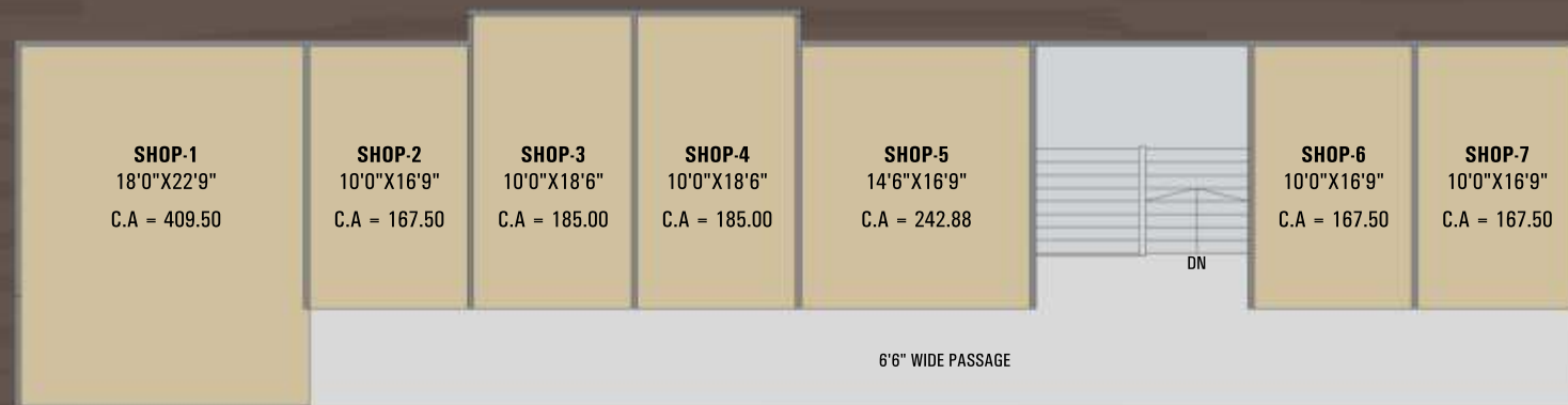
FIRST FLOOR TYPE : A