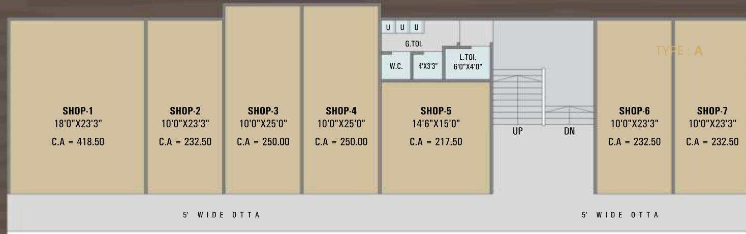
GROUND FLOOR TYPE : A