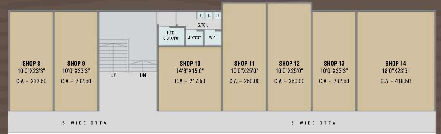
GROUND FLOOR TYPE : I