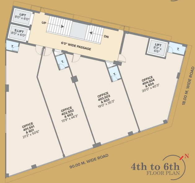
4th to 6th FLOOR PLAN