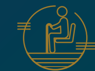
SENIOR CITIZEN AREA