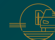
DROP OFF ZONE