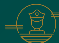
24 HRS SECURITY