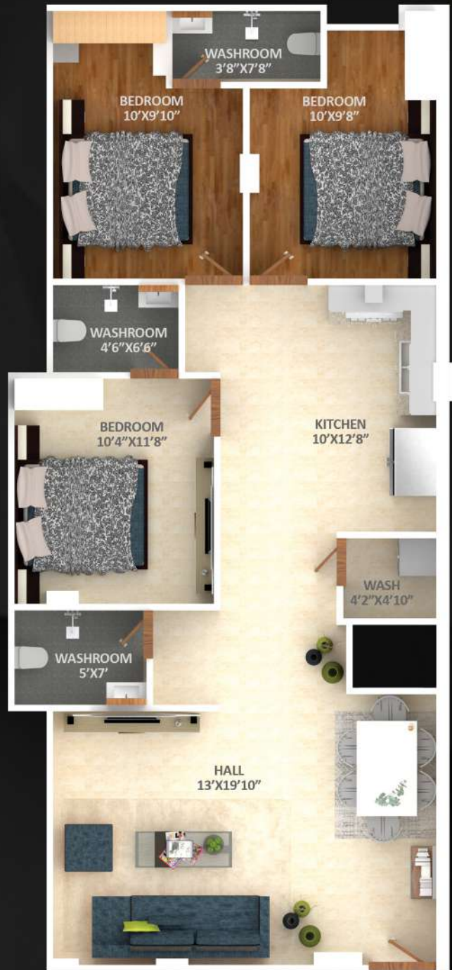
REAR FLAT FLOOR PLAN