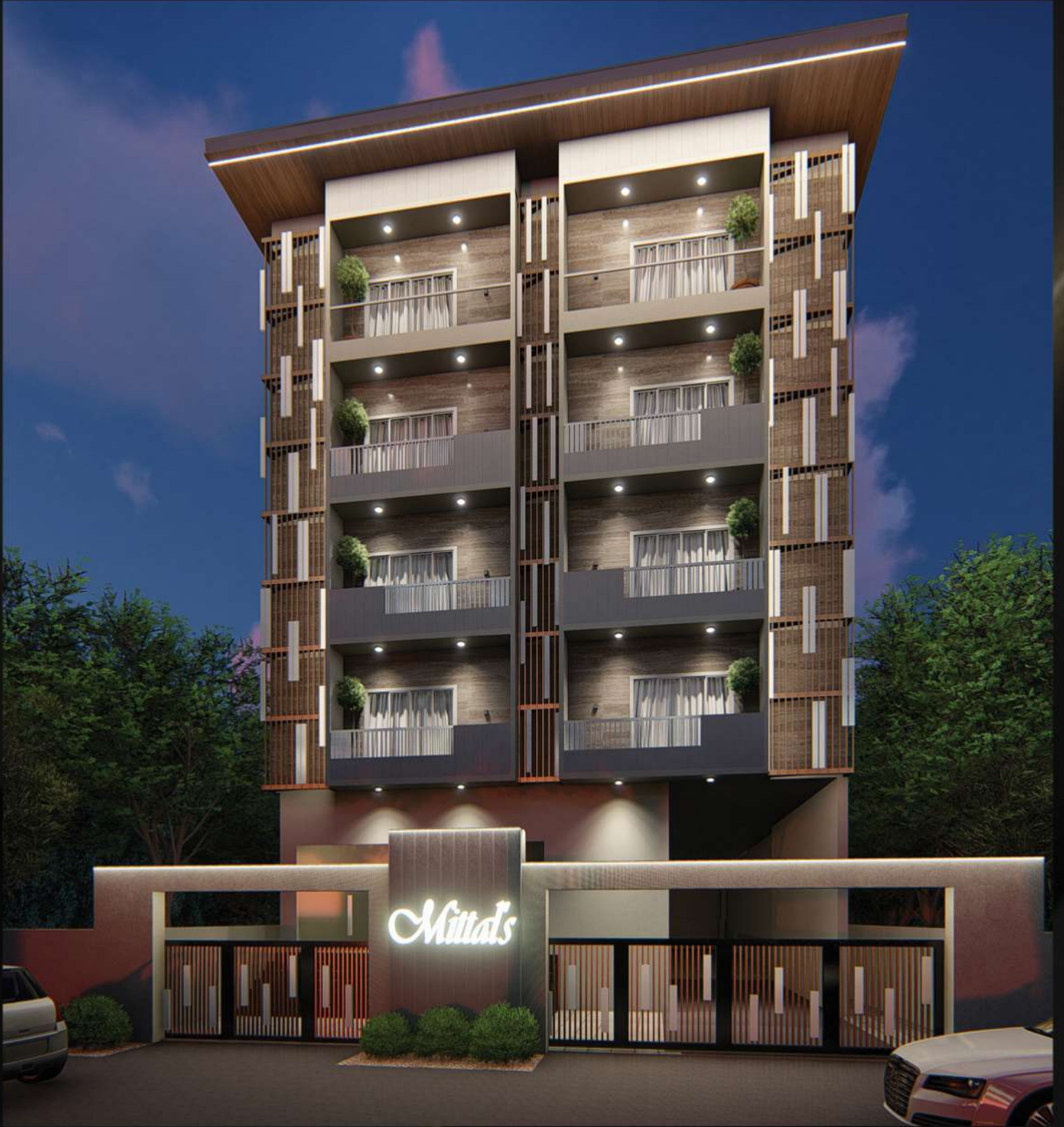
NIGHT VIEW OF BUILDING