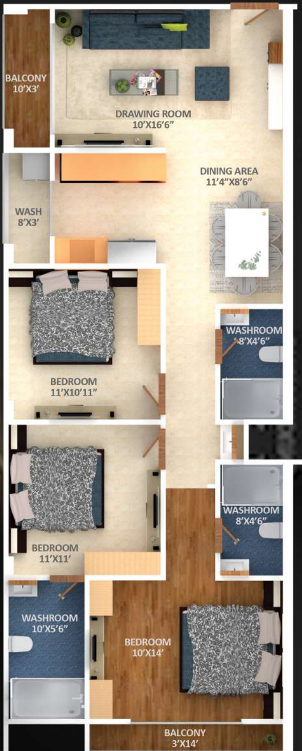
FRONT FLAT FLOOR PLAN