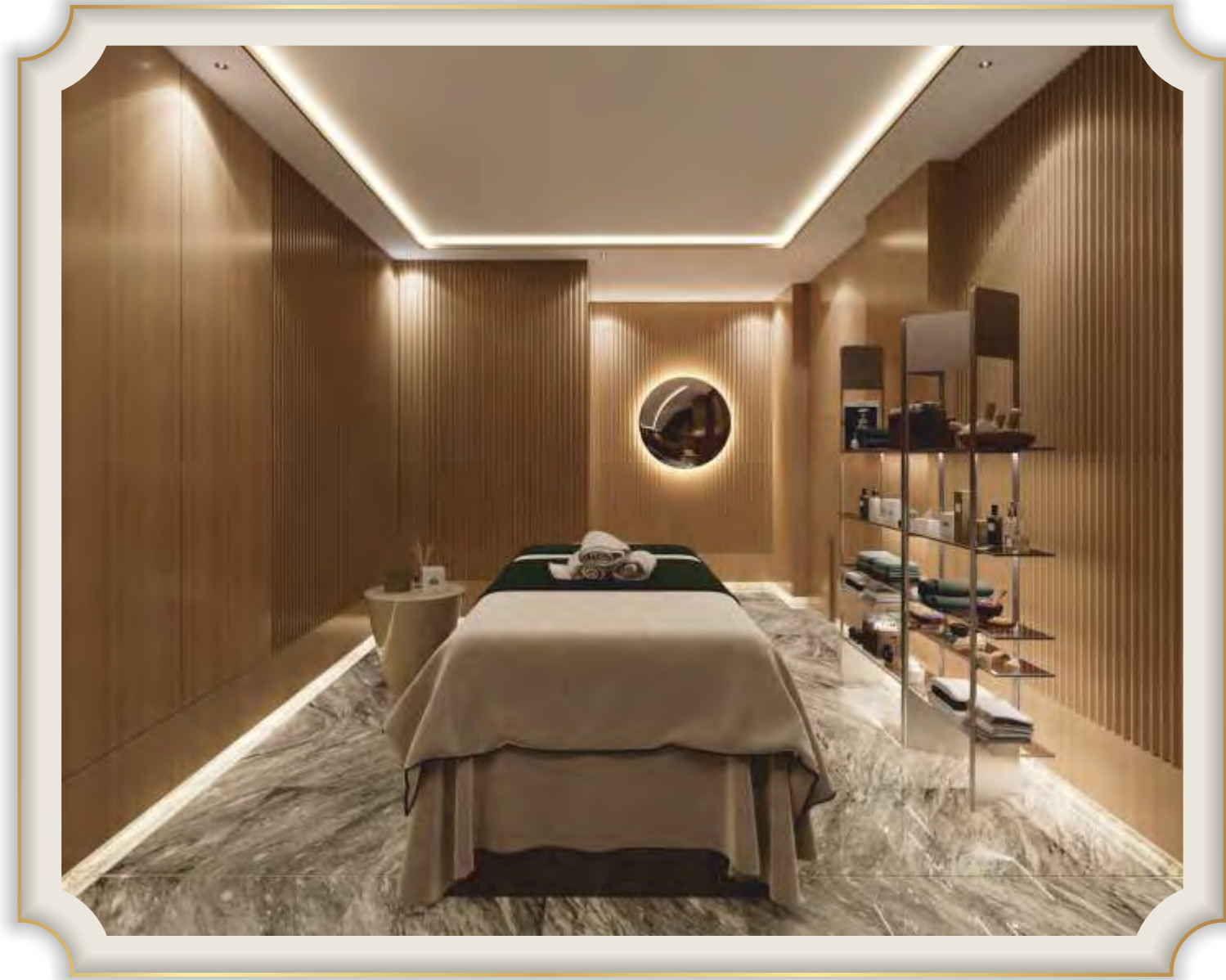
An in-house Spa and In-door weather controlled Swimming pool - amenities coveted even by the Royals!