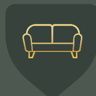
Grand Reception Foyer