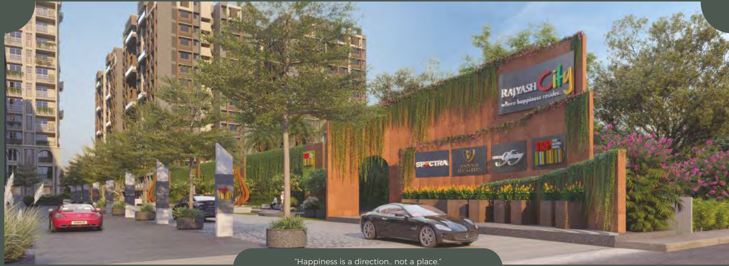
"Happiness is a direction.. not a place." A Happy Street that directs you to your Kingdom!