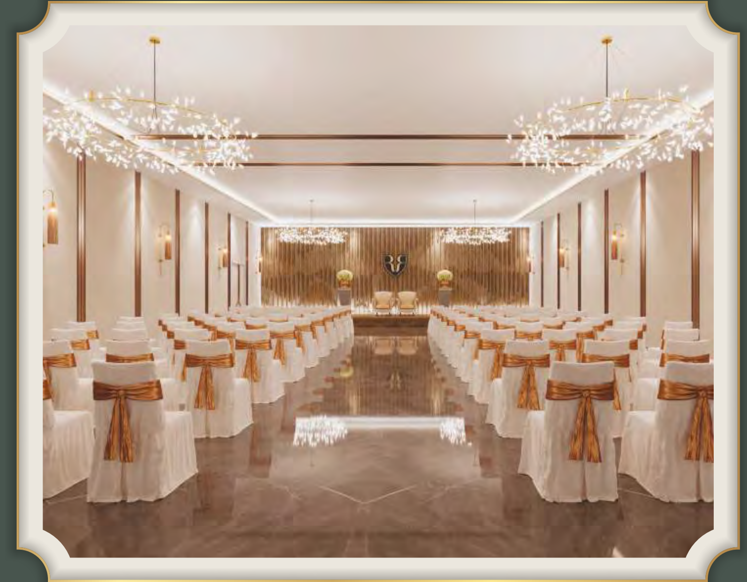
A Strikingly studded reception & banquet fit to welcome the Royalty.