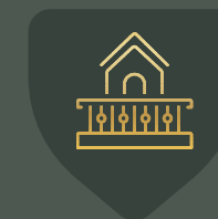
Grand Arrival Lounge