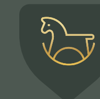
Infant Play Area