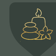
Steam - Sauna - Spa