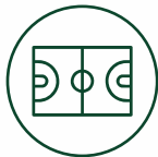
MULTI PURPOSE COURT