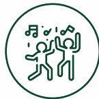
SATSANG/KITTY PARTY ROOM