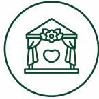
BANQUET HALL 1