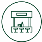
OPEN KITCHEN AREA