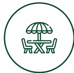
SNAKES & LADDERS