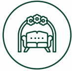
BANQUET HALL 2