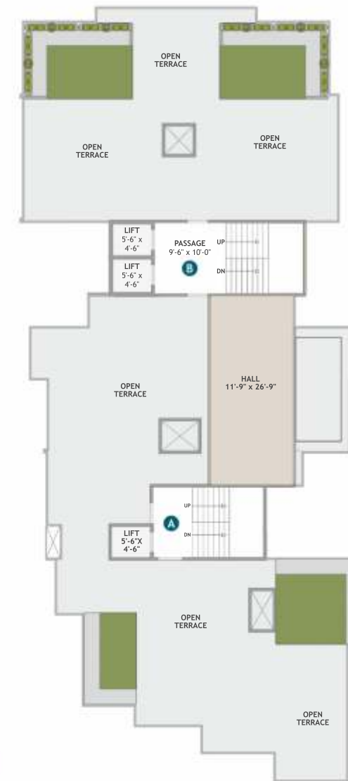
LAYOUT | TERRACE FLOOR