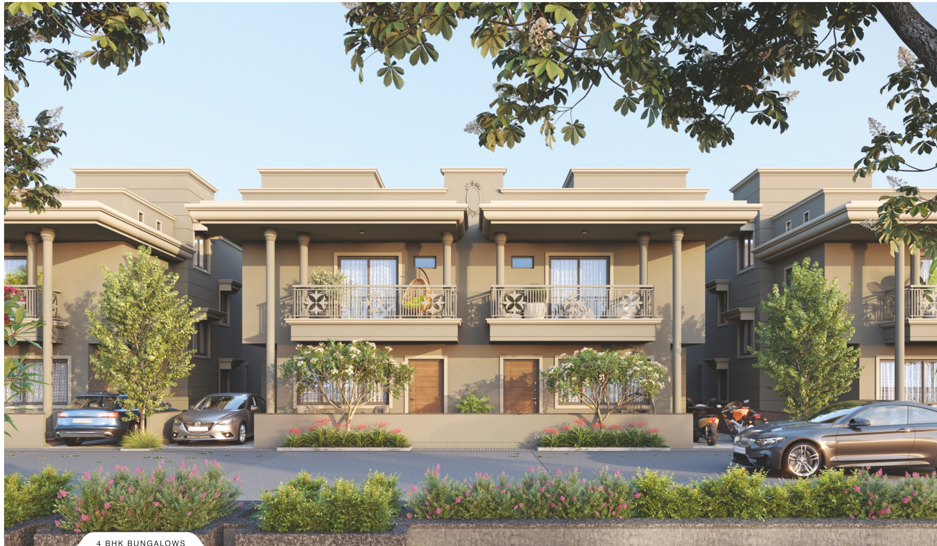
4 BHK BUNGALOWS