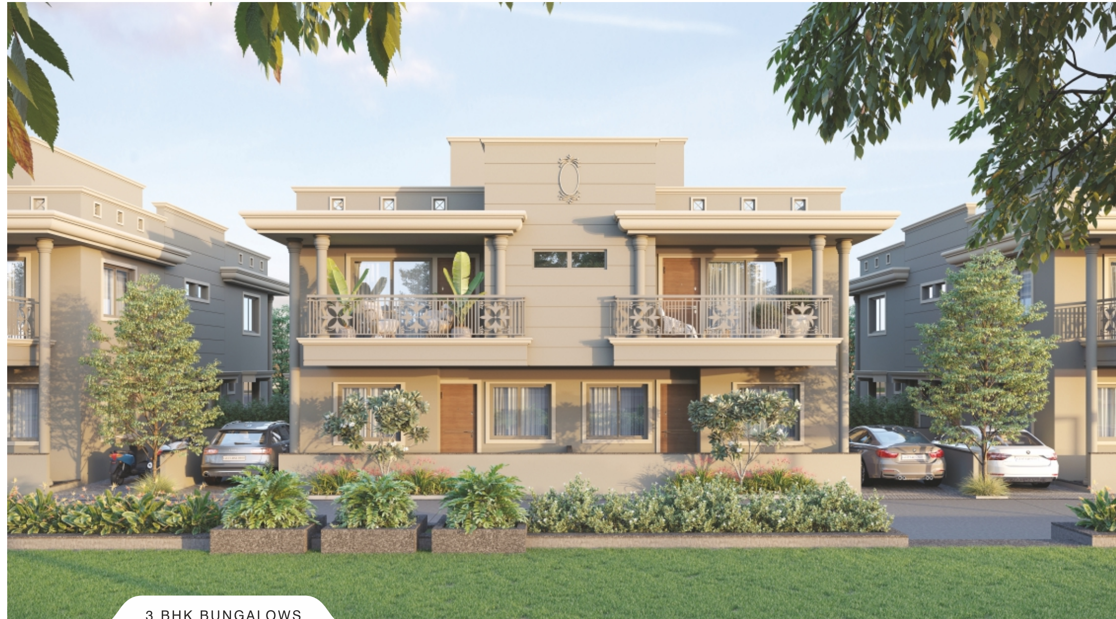
3 BHK BUNGALOWS