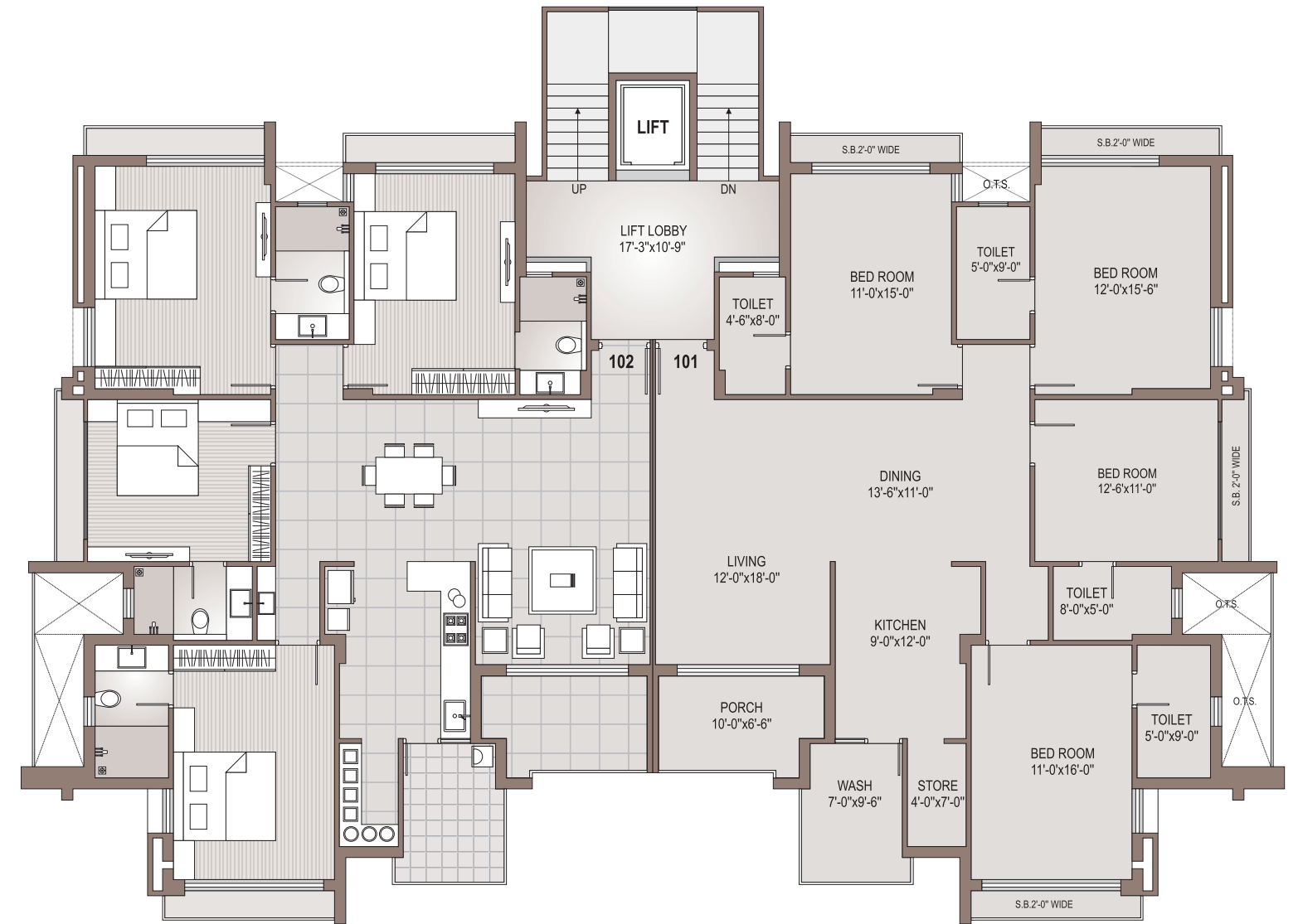
Typical floor plan (2nd. to 6th.)