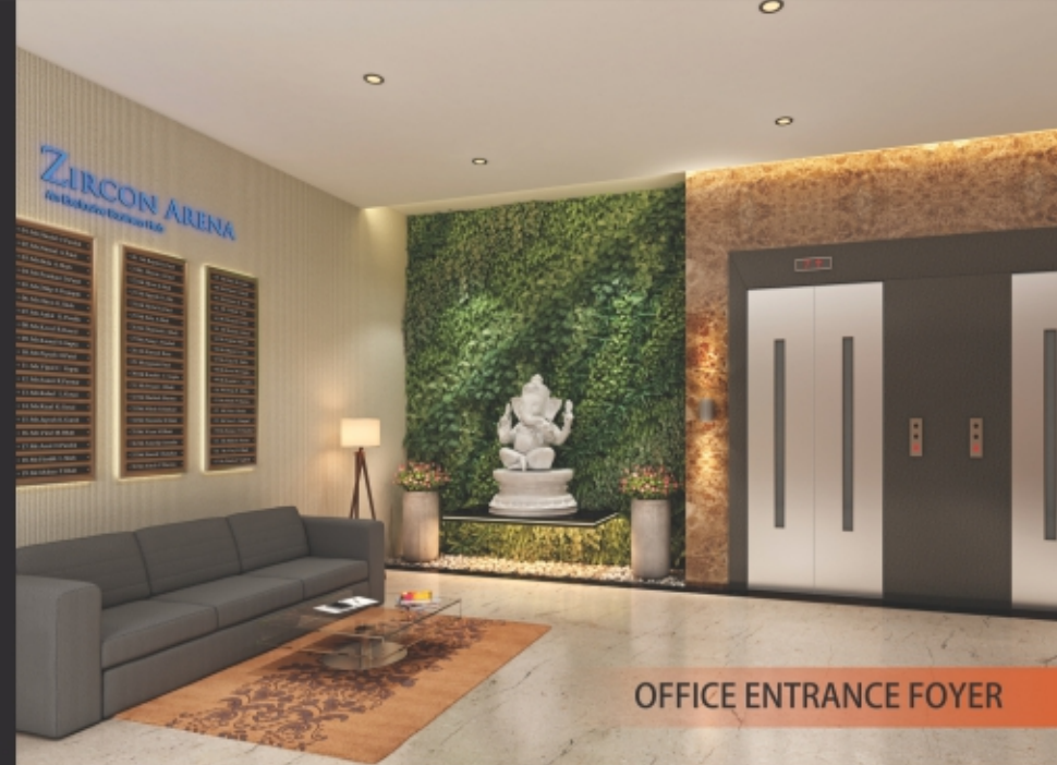
OFFICE ENTRANCE FOYER

It is surprising. The entrance foyer is the preview. Smooth floor and walls with hygiene. Impressive and balanced lighting. Ever ready escalators to lift you up. Evenly placed flower pots. Luxury in movement area with wider space.