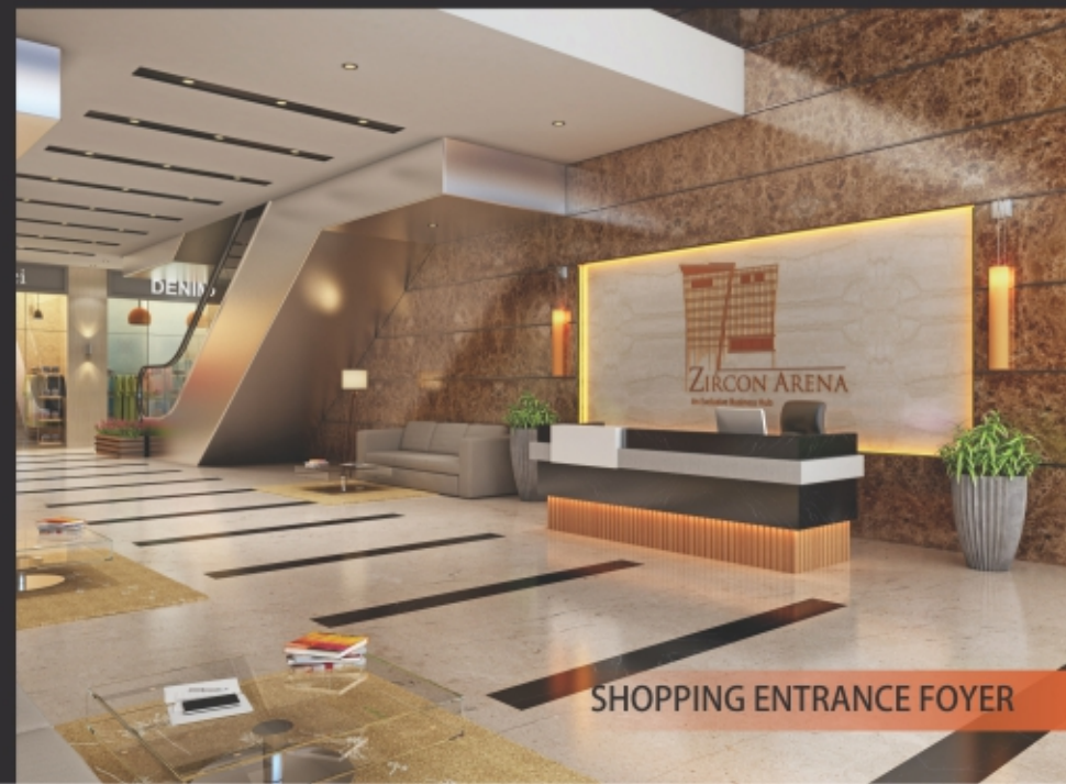
SHOPPING ENTRANCE FOYER