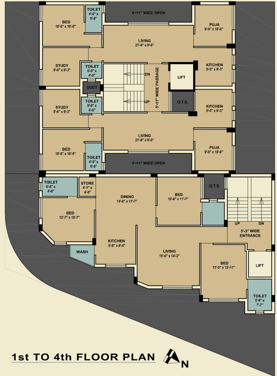
1st TO 4th FLOOR PLAN