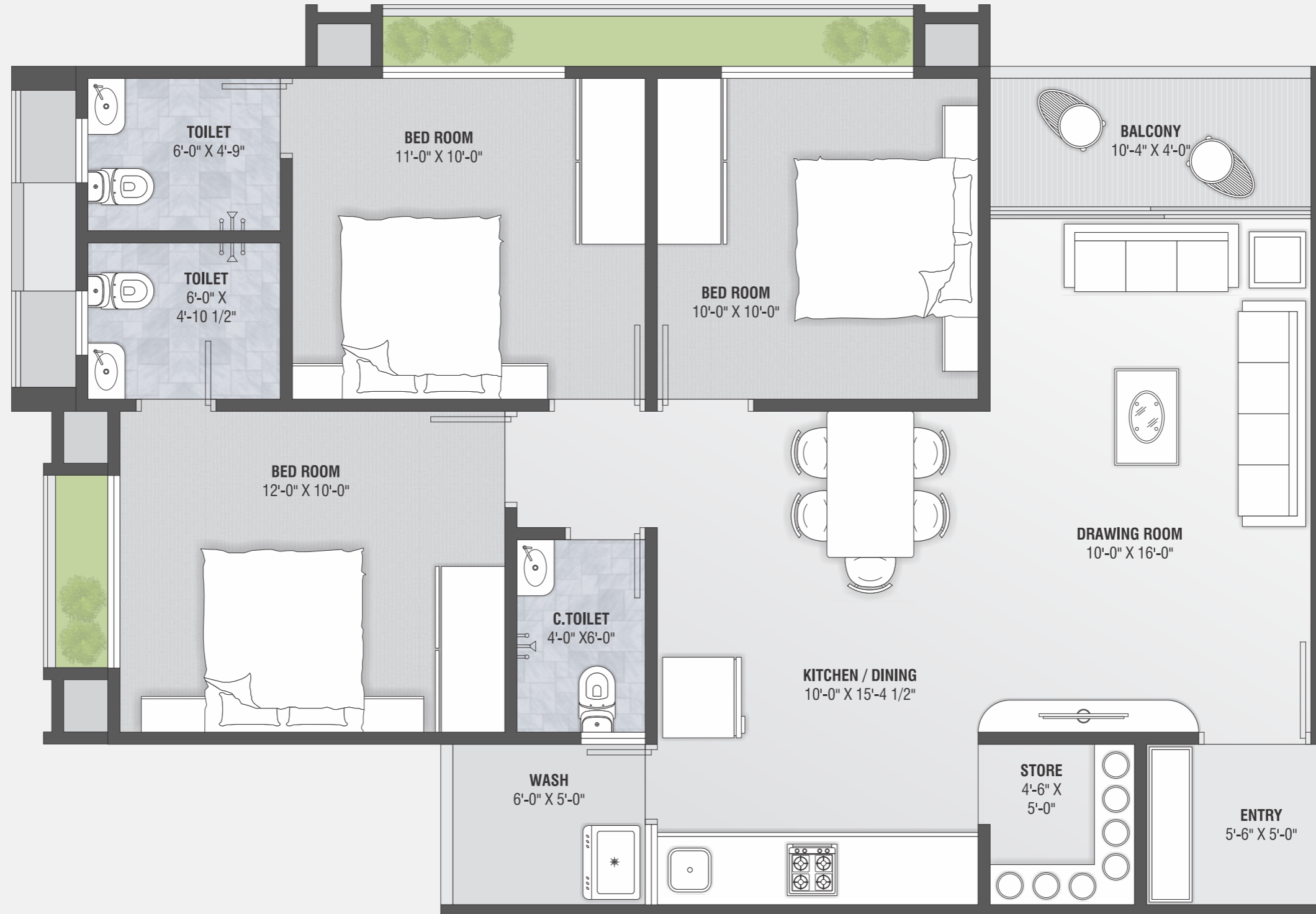
BLOCK B UNIT PLAN