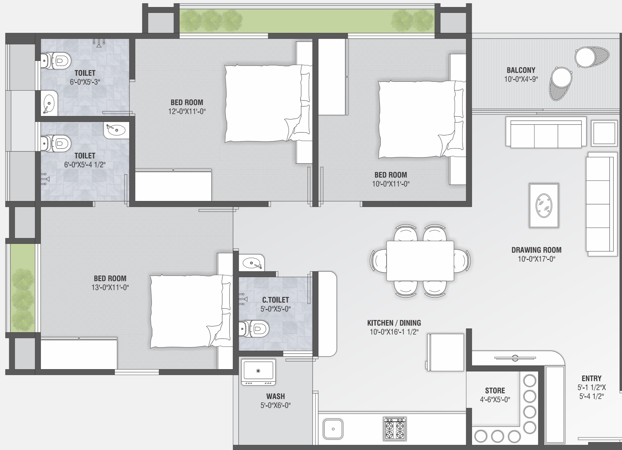
BLOCK A UNIT PLAN