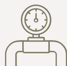
ADANI GAS SUPPLY