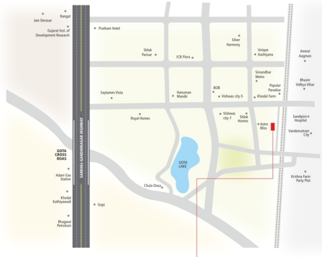
SITE: SOLITAIRE VISTA Opp. Popular Paradise, Satyamev Vista road, Near Koushiam Residency, Gota, Ahmedabad.