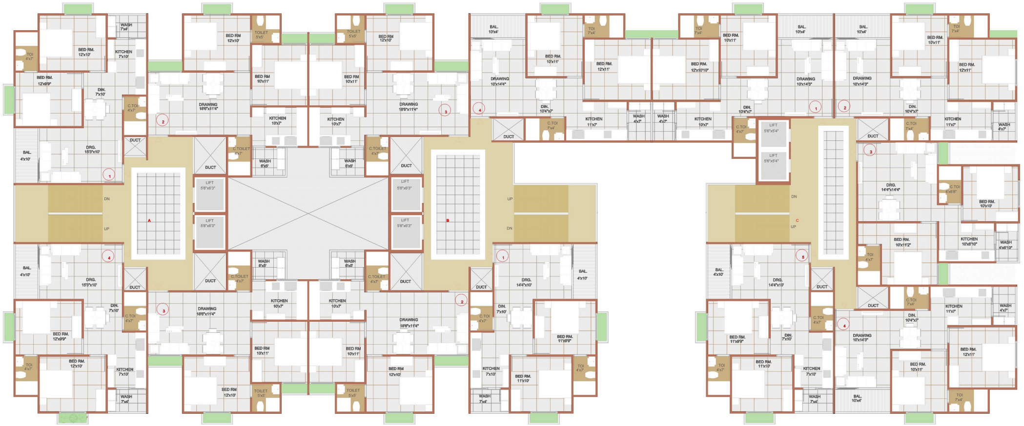
TYPICAL LAYOUT FLOOR PLAN FROM 1 ST TO 7 TH FLOOR