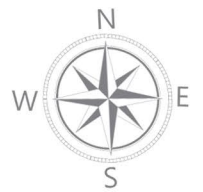
TYPICAL LAYOUT FLOOR PLAN FROM 1 ST TO 7 TH FLOOR