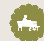
SENIOR CITIZEN AREA