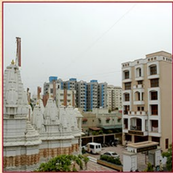
Prerna Tirth Jain Derasar & Upashray