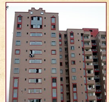
Prerna Viraj 2