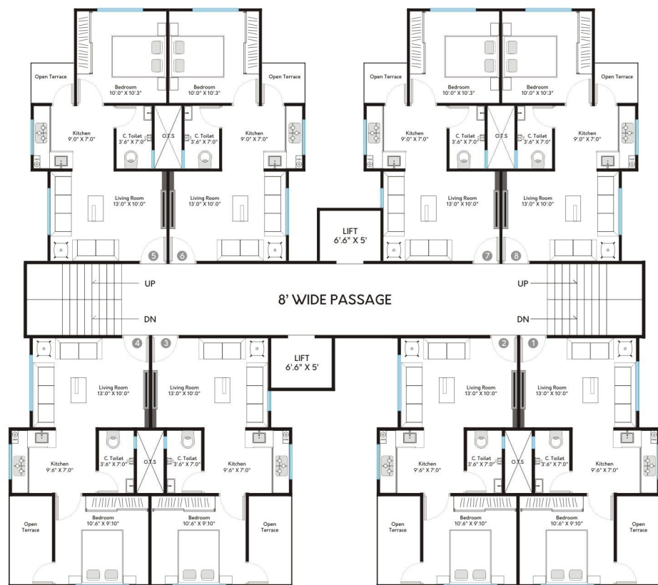
FLOOR PLAN 5 FLOOR