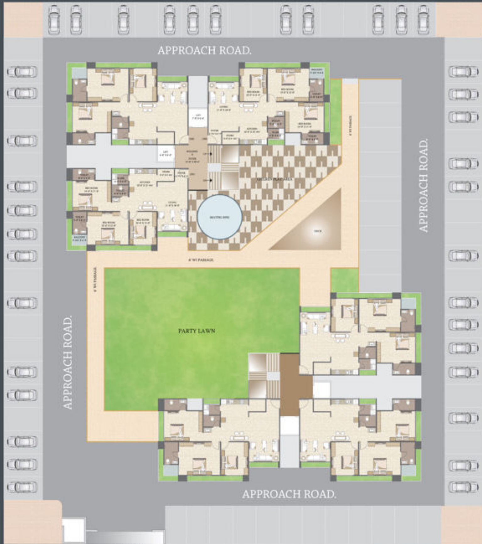
TYPICAL FLOOR PLAN (G+14 FL.)