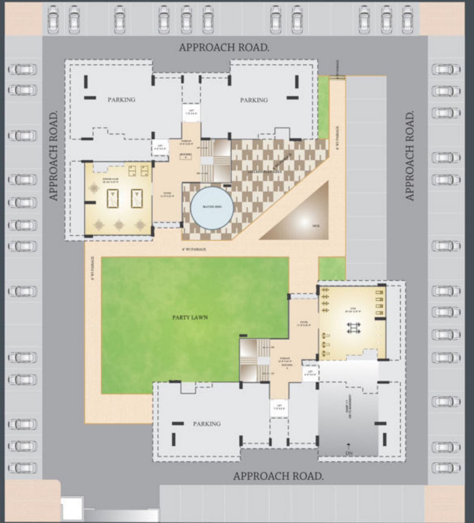
GROUND FLOOR PLAN (G+14 FL.)