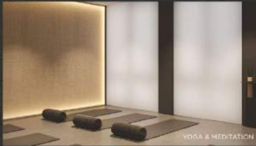
YOGA & MEDITATION