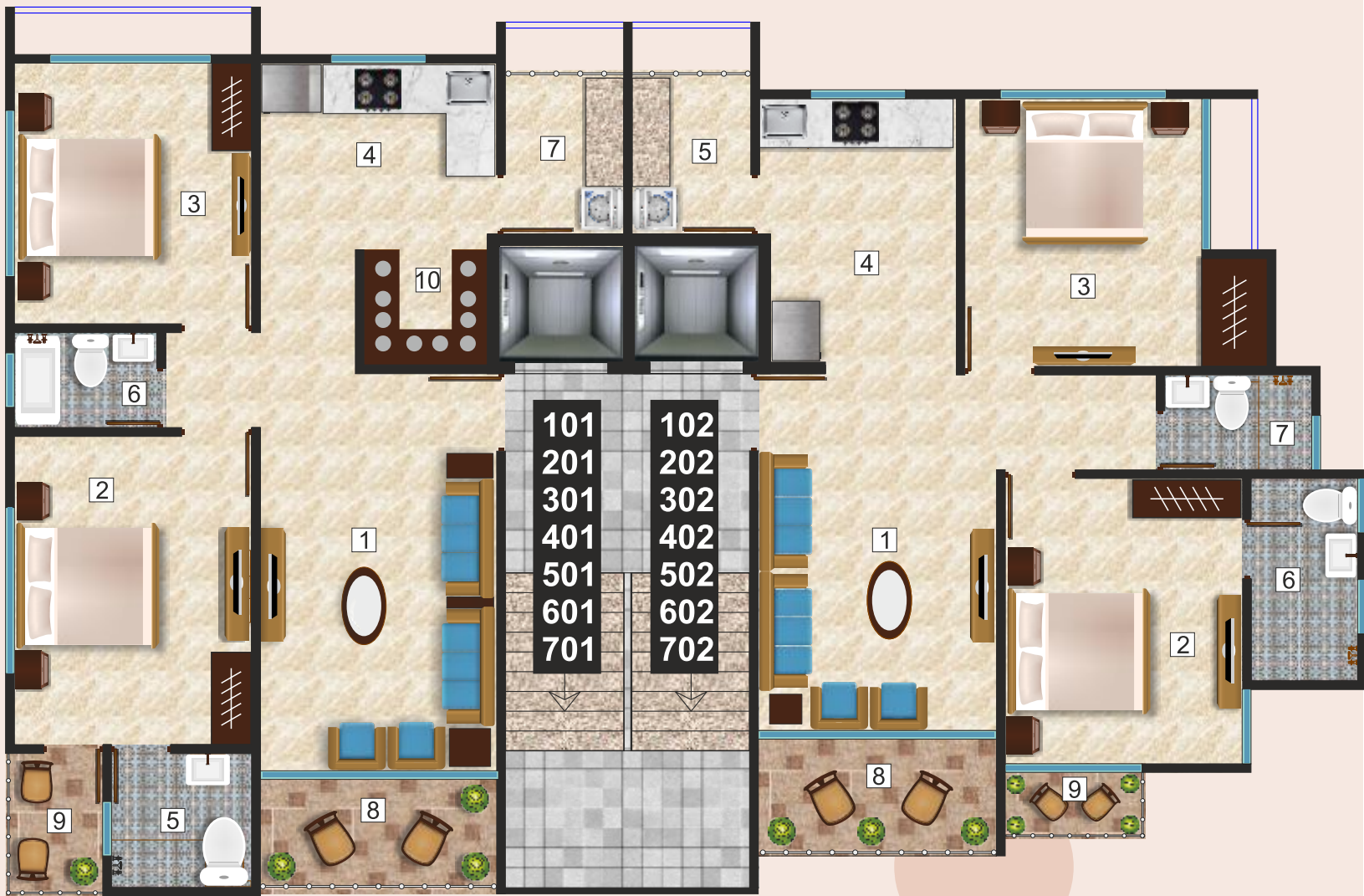
Unit 101 - 701