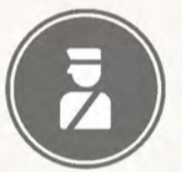
24 X 7 Security