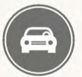
Ground Floor & Basement With Multi Level Car Parking Provision

We do not dress up the abodes with empty aesthetics but with function and utility too. Let this home be the perfect space for you to flaunt, unwind, rest, rejuvenate, and shine, always!