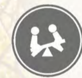
Indoor & Outdoor Kids Play Area