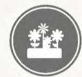
Lush Green Landscape