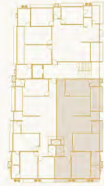
TYPE - 2