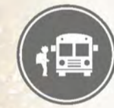
Pick Up Zone