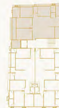
TYPE - 3