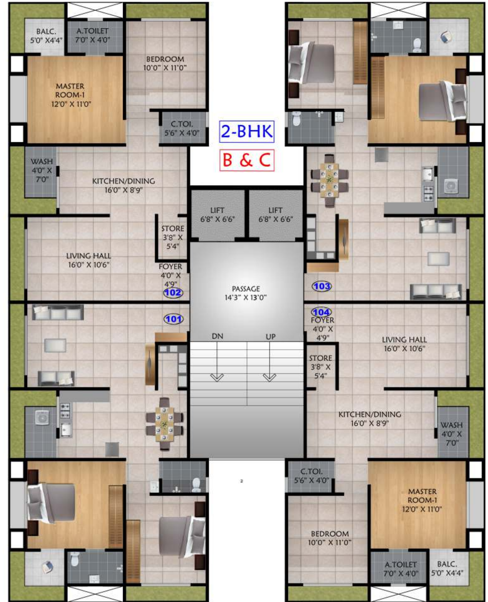
Tower B & C (2 BHK) 1 st to 14 th Typical Floor Plan