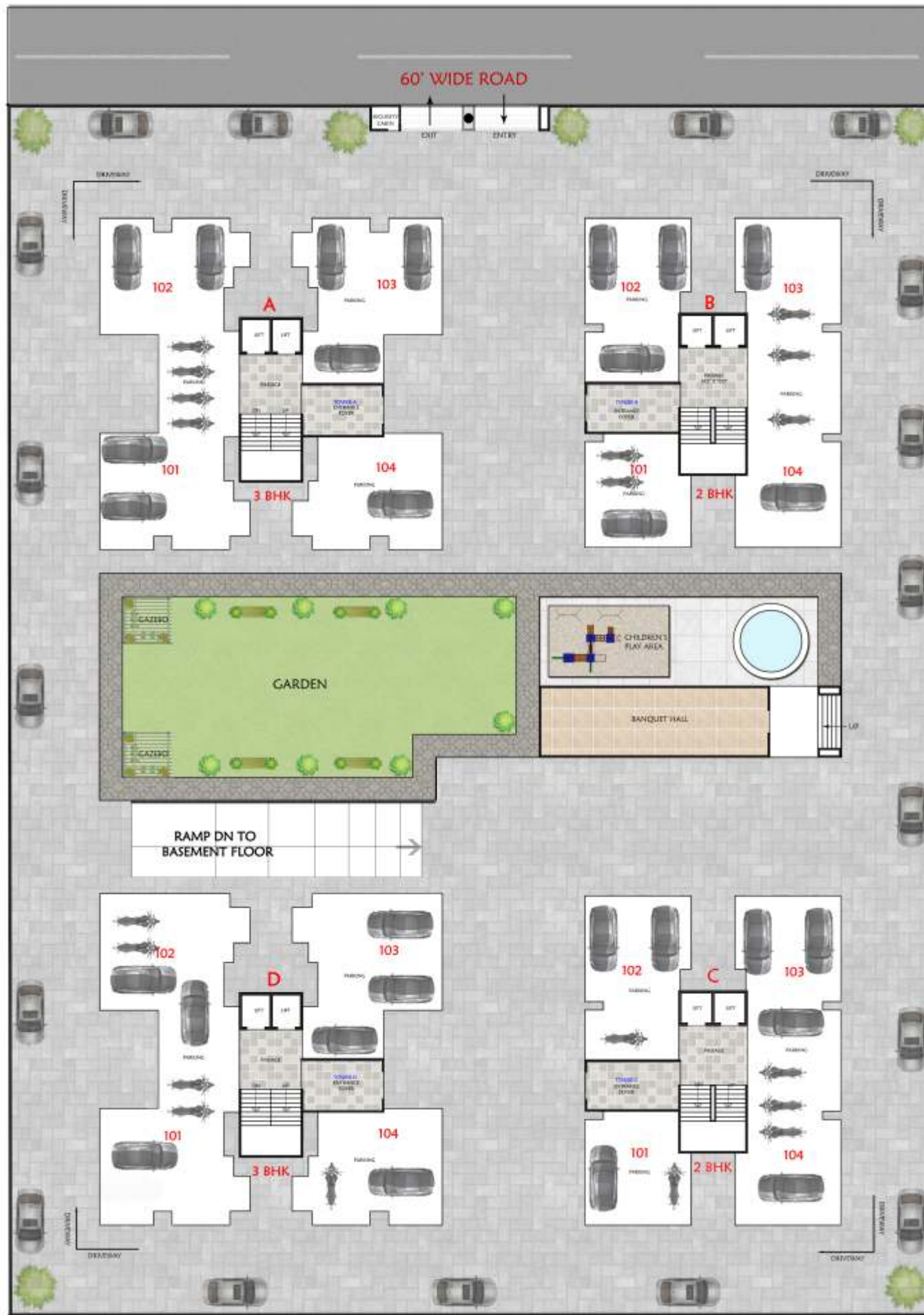
GROUND FLOOR LAYOUT PLAN