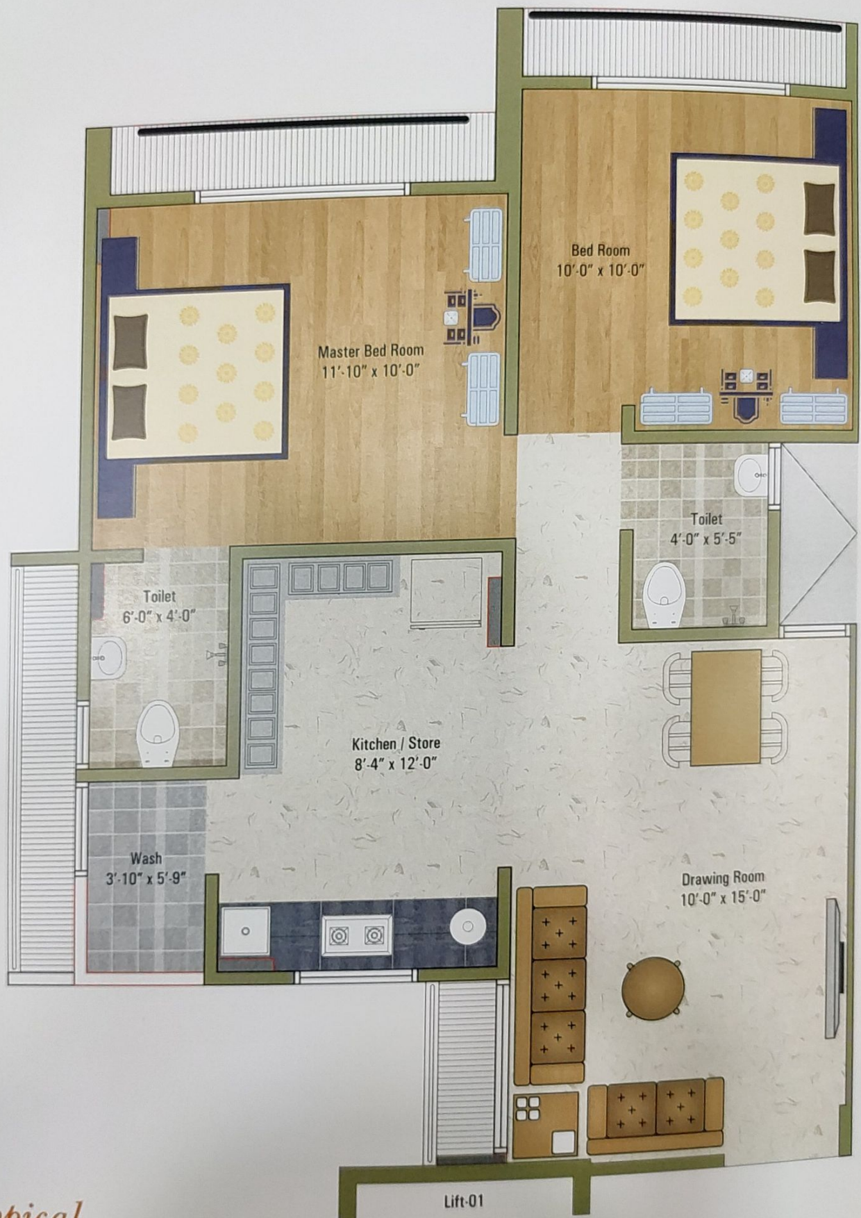
typical layout plan