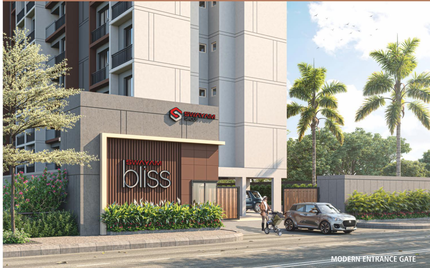
MODERN ENTRANCE GATE