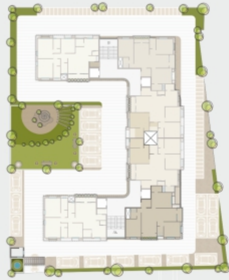
TYPE - B1 3 BHK TYPICAL FLOOR PLAN