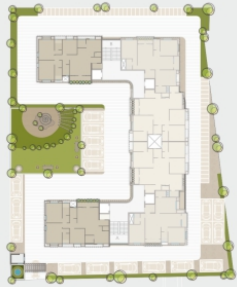
TYPE - A /A1 3 BHK TYPICAL FLOOR PLAN