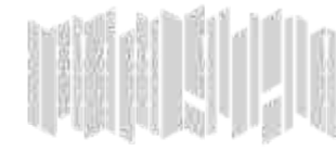
TYPE D - No.12