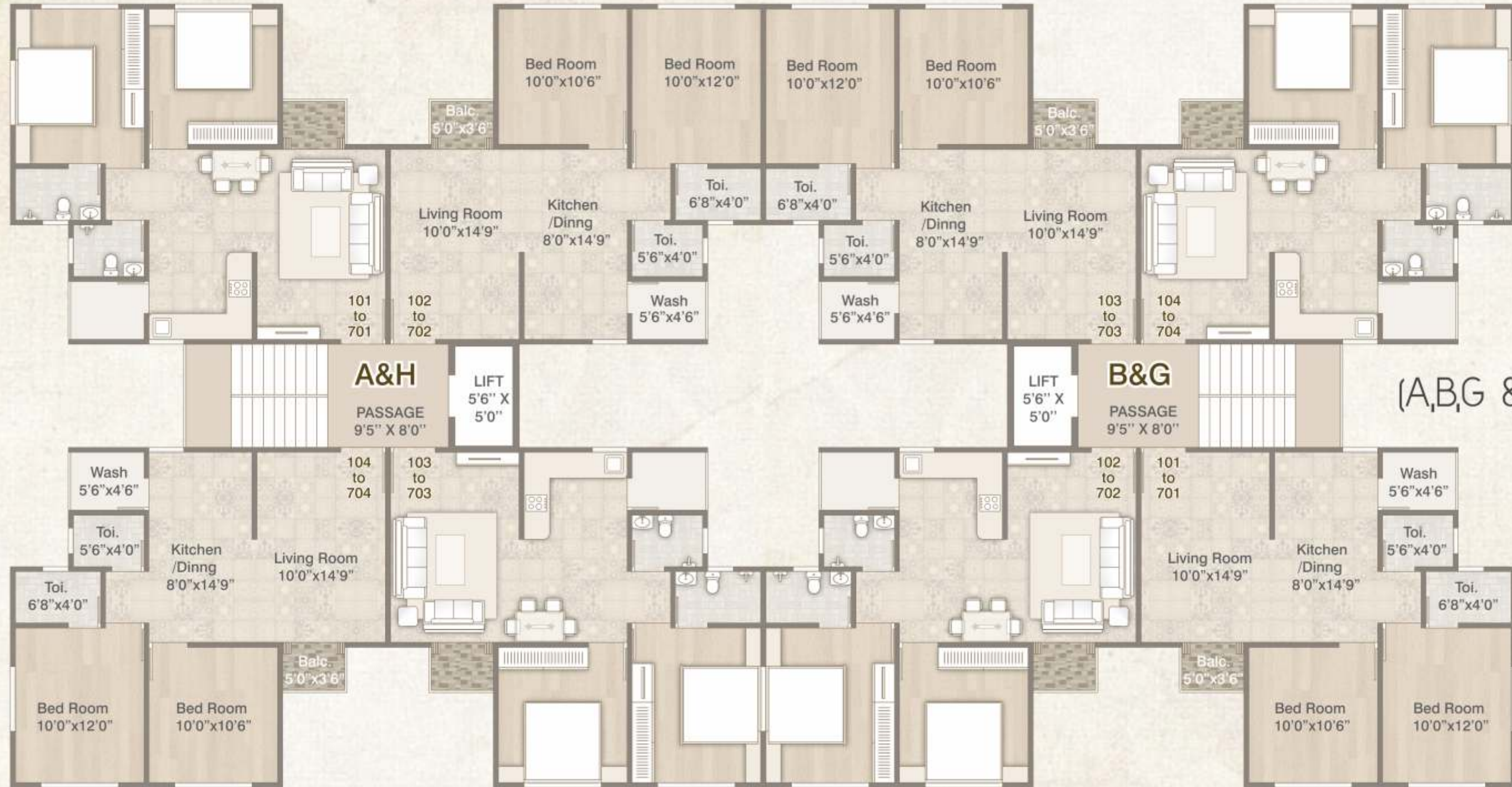
(A,B,G & H) Typical Tower floor plan