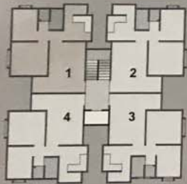
Typical Floor Plan 2 BHK