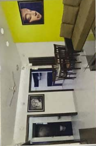
Actual photographs of Furnished Sample Flat