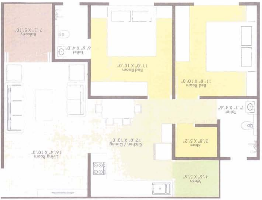
A&B 2 BHK 1ST TO 8TH TYPICAL FLOOR