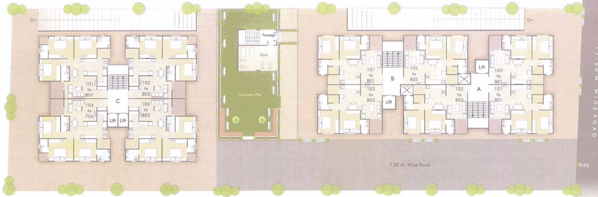
TYPICAL FLOOR LAYOUT