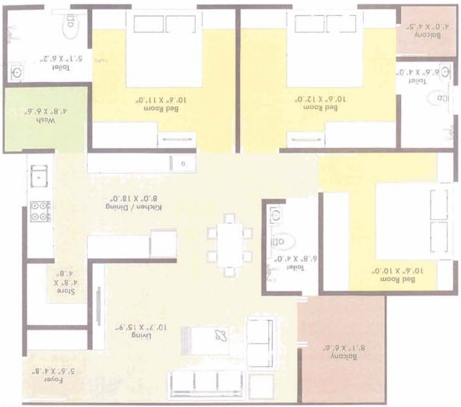
C 3 BHK 1ST TO 8TH TYPICAL FLOOR