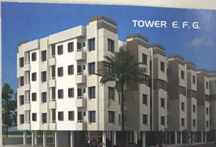
TOWER E, F, G.