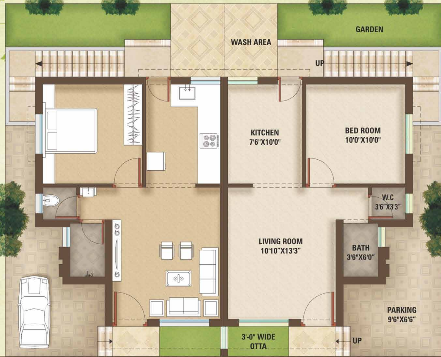
GROUND FLOOR PLAN PLOT AREA: 781. SQ.FT. SBA: 600. SQ.FT.