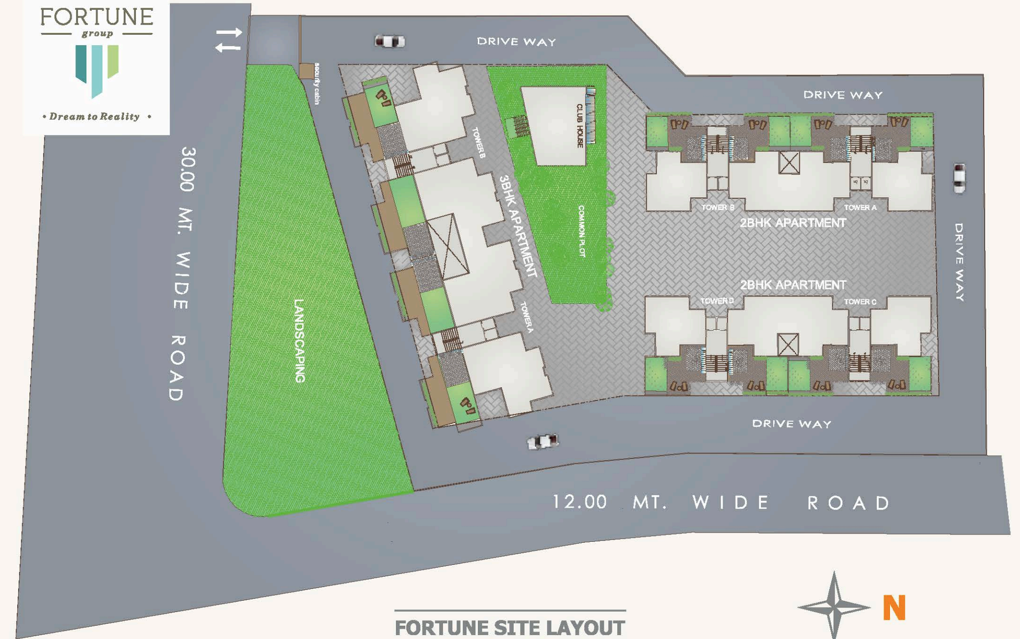
FORTUNE SITE LAYOUT