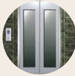
Glass Autodoor lift