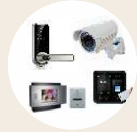
Four Layers Security