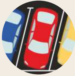
Alloted Car Parking