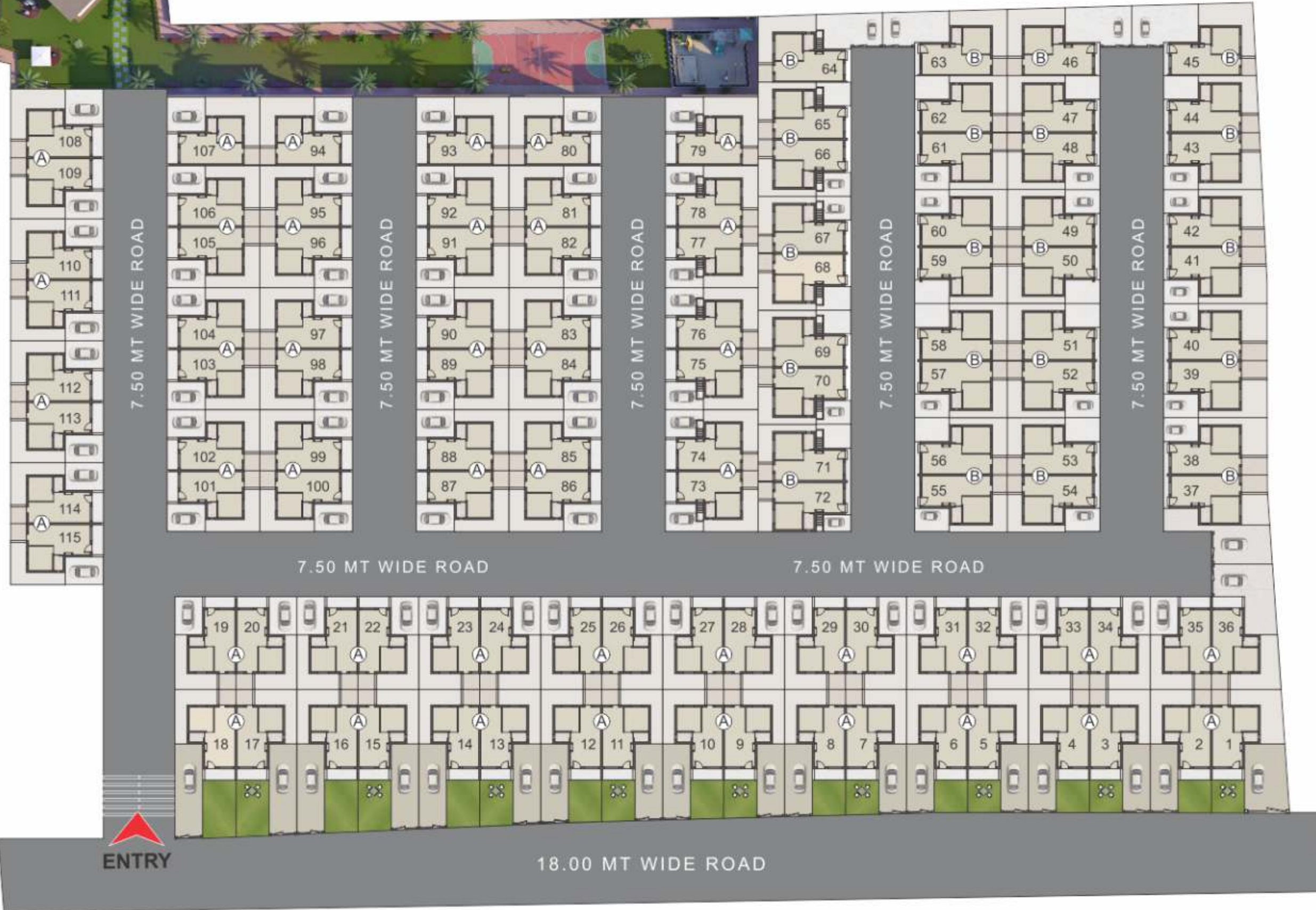
MINIMUM PLOT AREA (SQ.FT.)