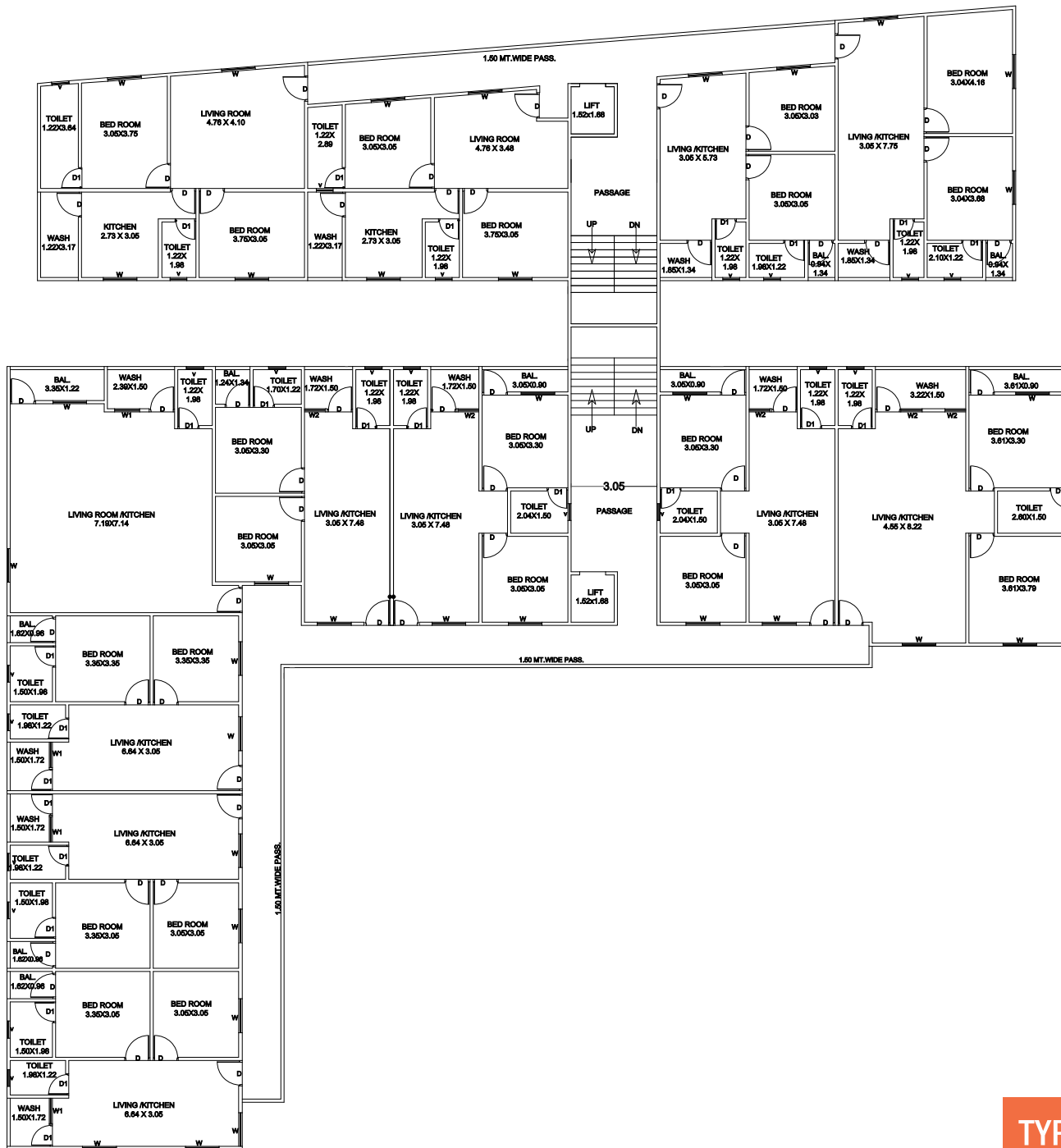
TYPICAL FLOOR PLAN-2 ND -3 RD -4 TH