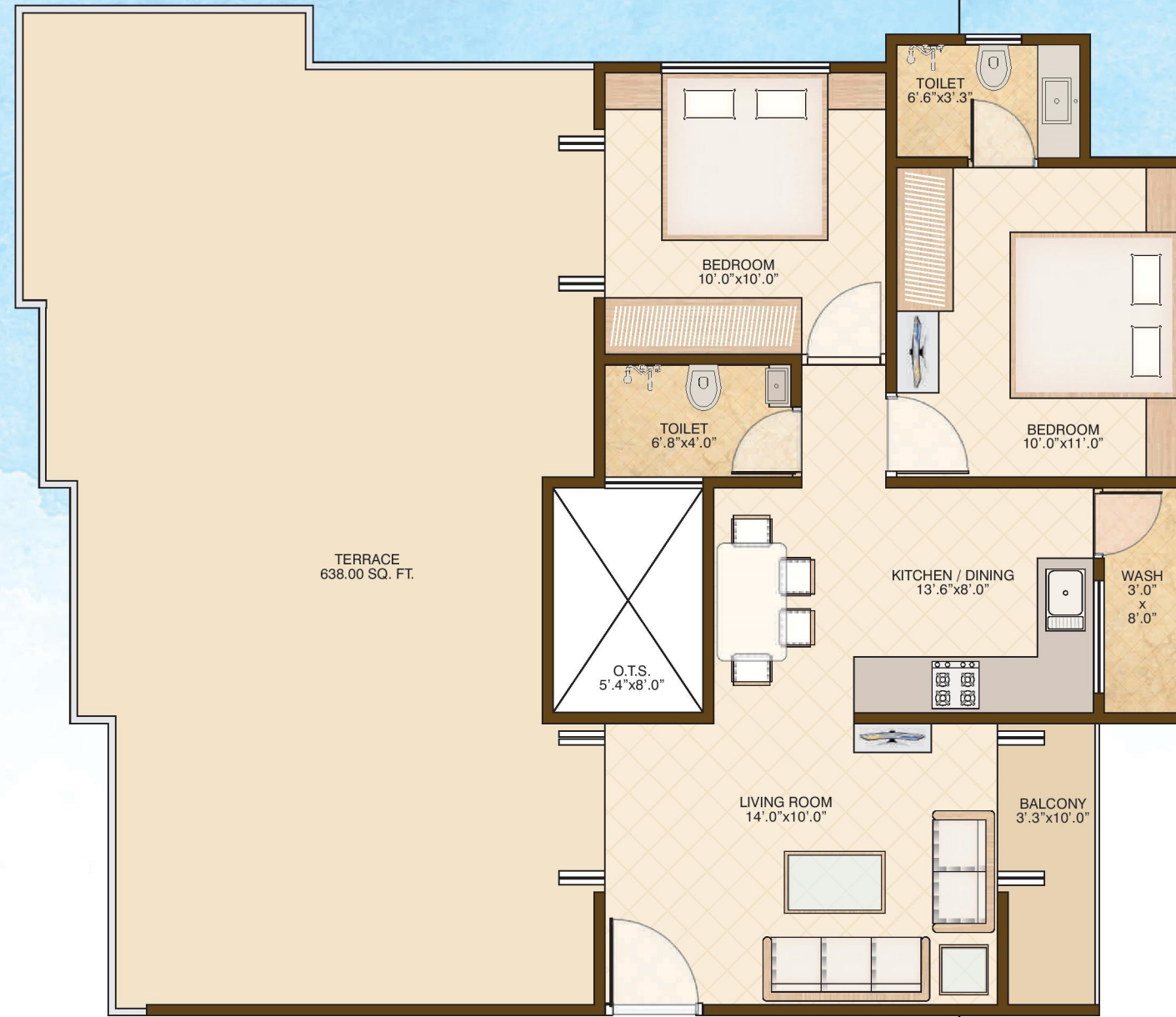
2 BHK (PENT HOUSE)