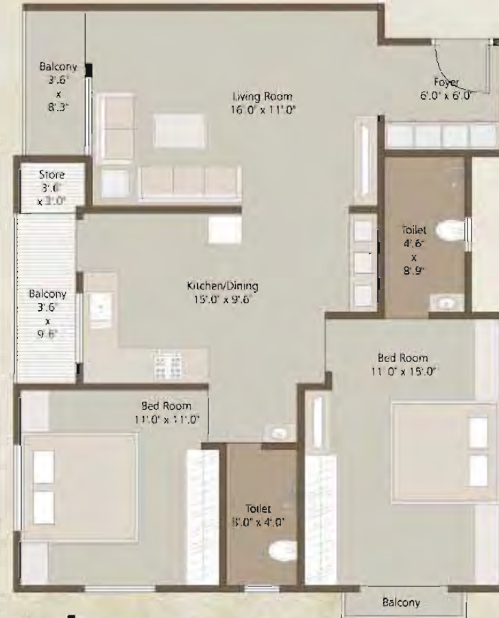
c-d 2-BHK TYPICAL FLOOR PLAN