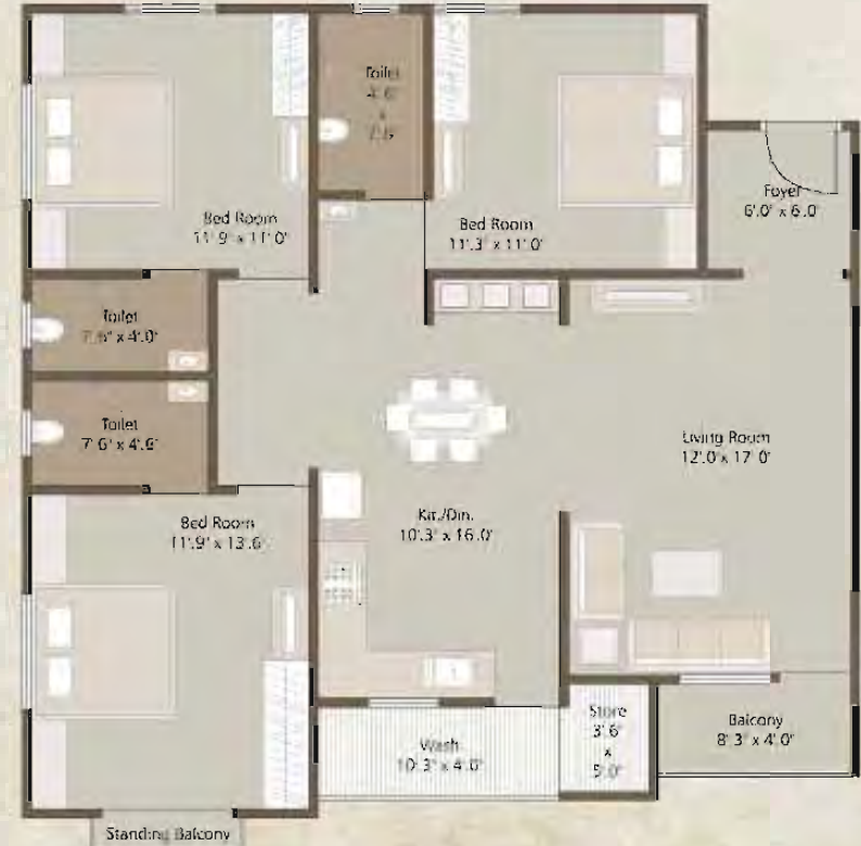
a-b 3-BHK TYPICAL FLOOR PLAN