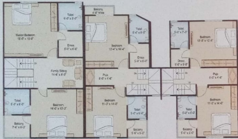
First Floor Plan Block No. 11, 10.9