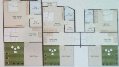
Second Floor Plan Block No. 11, 10.9