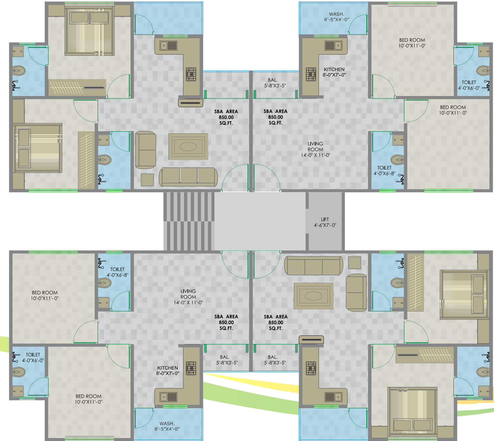
TYPICAL 2BHK FLOOR PLAN